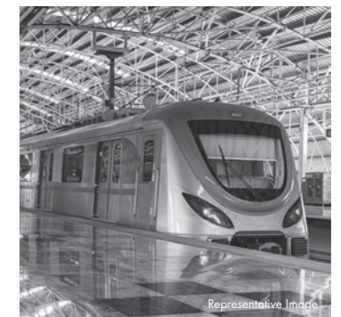
Erected Bangalore Metro Car Shed.