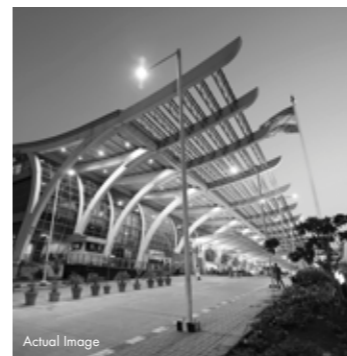
Goa Dabolim Airport Expansion.