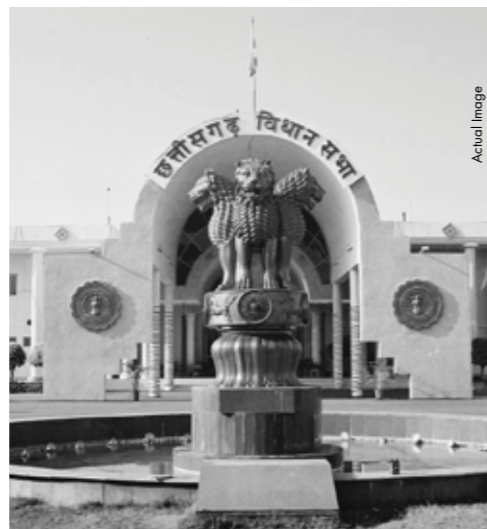
Legislative Assembly, Chhattisgarh