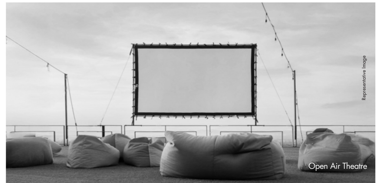
Serenity Amidst the Night Skies.

And many more experiences on the rooftop and ground level.