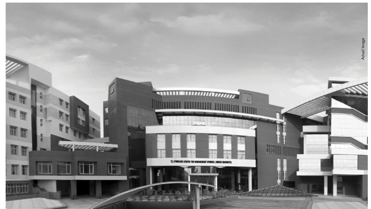
Symbiosis Centre of Management Studies

Mumbai's Tallest Commercial Tower in 2013. Completed in just 34 Months.