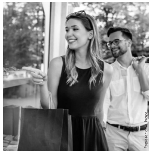
Here, Designer Labels and Dream Homes Go Hand in Hand.