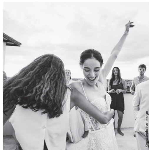
Your Neighbours Here Are Overachievers, Just Like You.