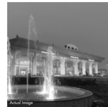
Jalandhar's New State-of-the-Art Adampur Airport.