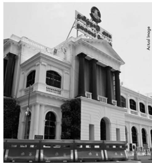
Legislative Assembly, Tamil Nadu