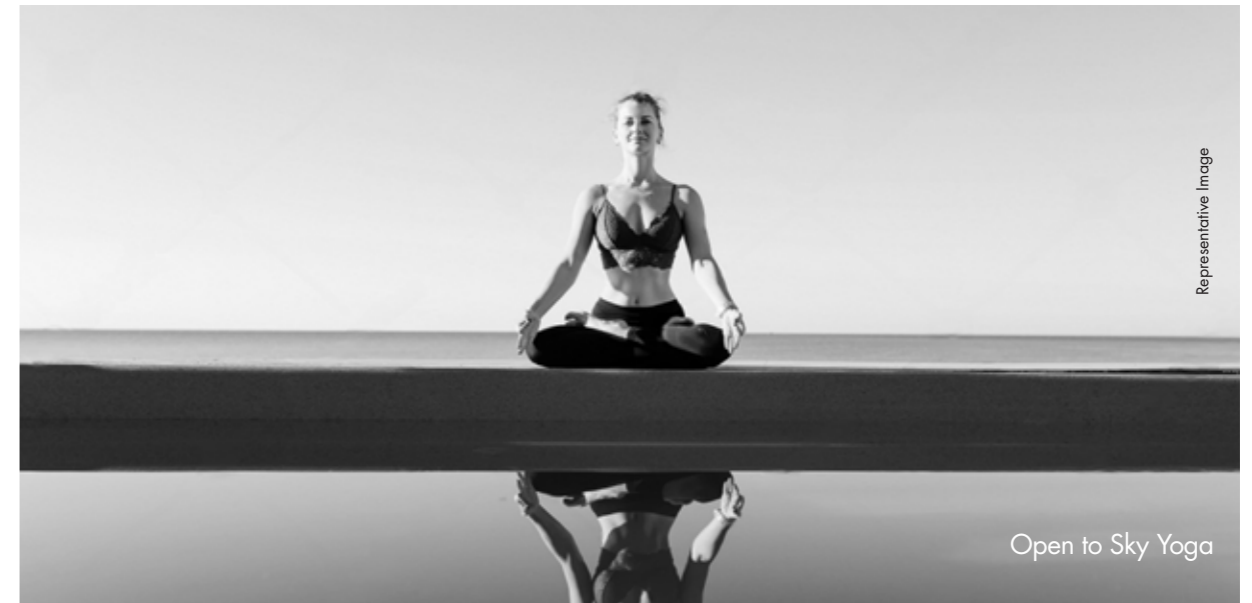
Rejuvenation Amidst the Clouds.