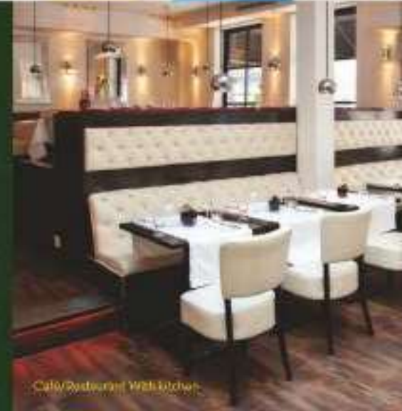
Cafe/Restaurant With Kitchen