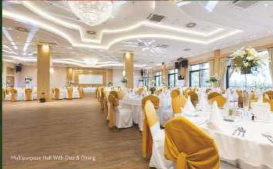
Multi-purpose Hall With Bar & Dining