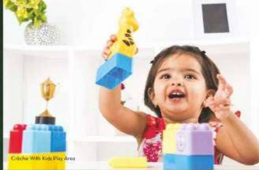
Crèche With Kids Play Area

You Are One Massage Away From A Good Mood