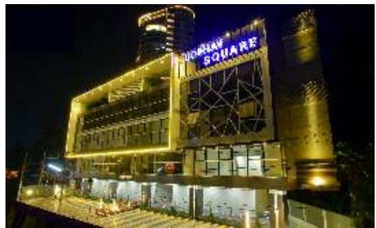
Udbhav Square, Kottara Chowki

FOR BOOKINGS CONTACT : ☎ 96631 64343, 72593 76873