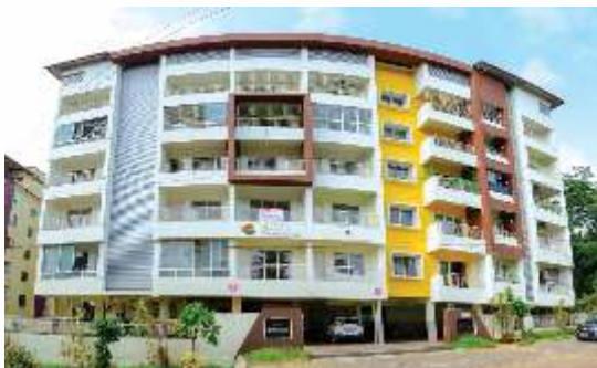
Bhaskar Coconut Groves, Maroli