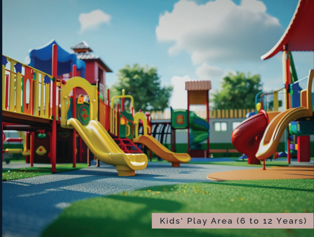
Kids' Play Area (6 to 12 Years)