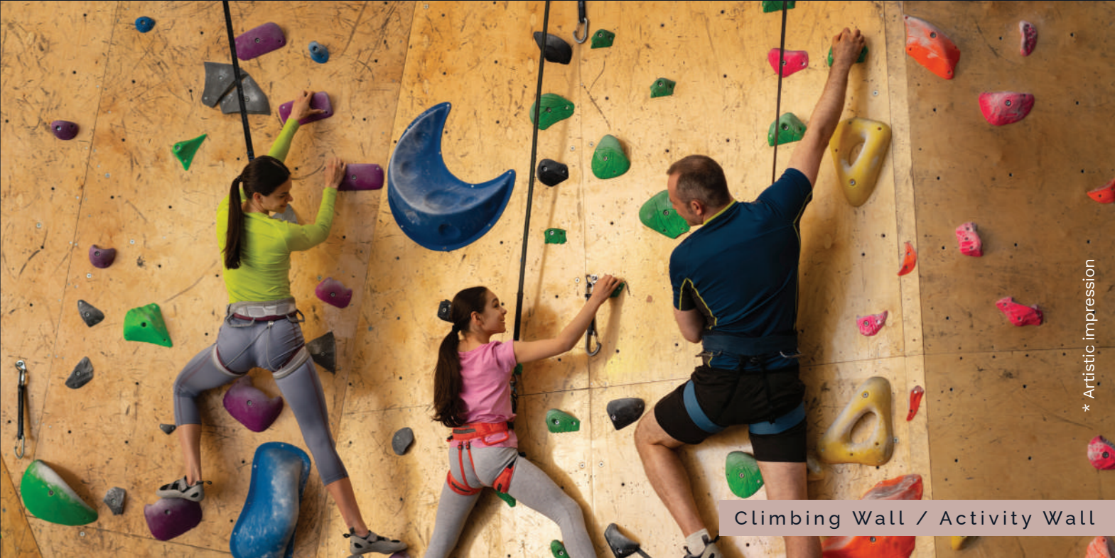
Climbing Wall / Activity Wall