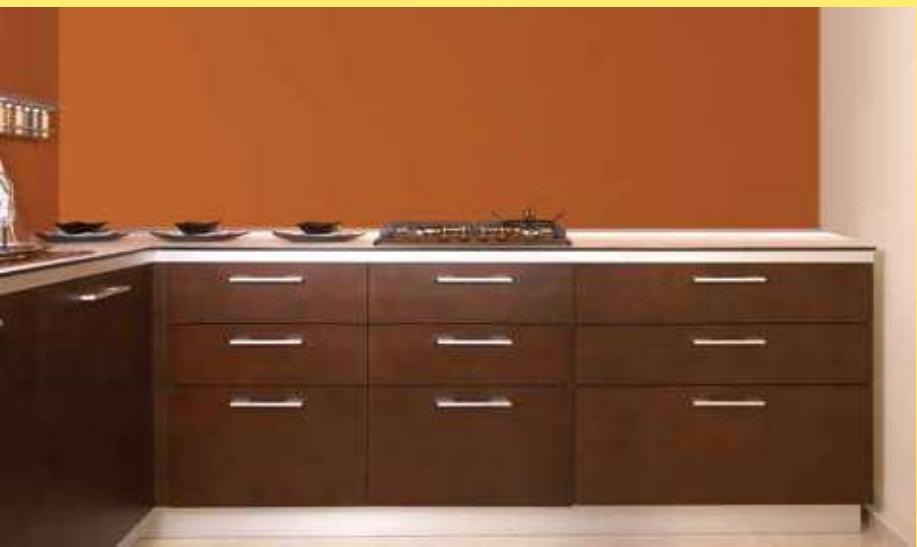
◀ Basic Modular Kitchen