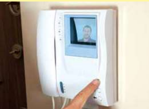
Video Door Phone ▼