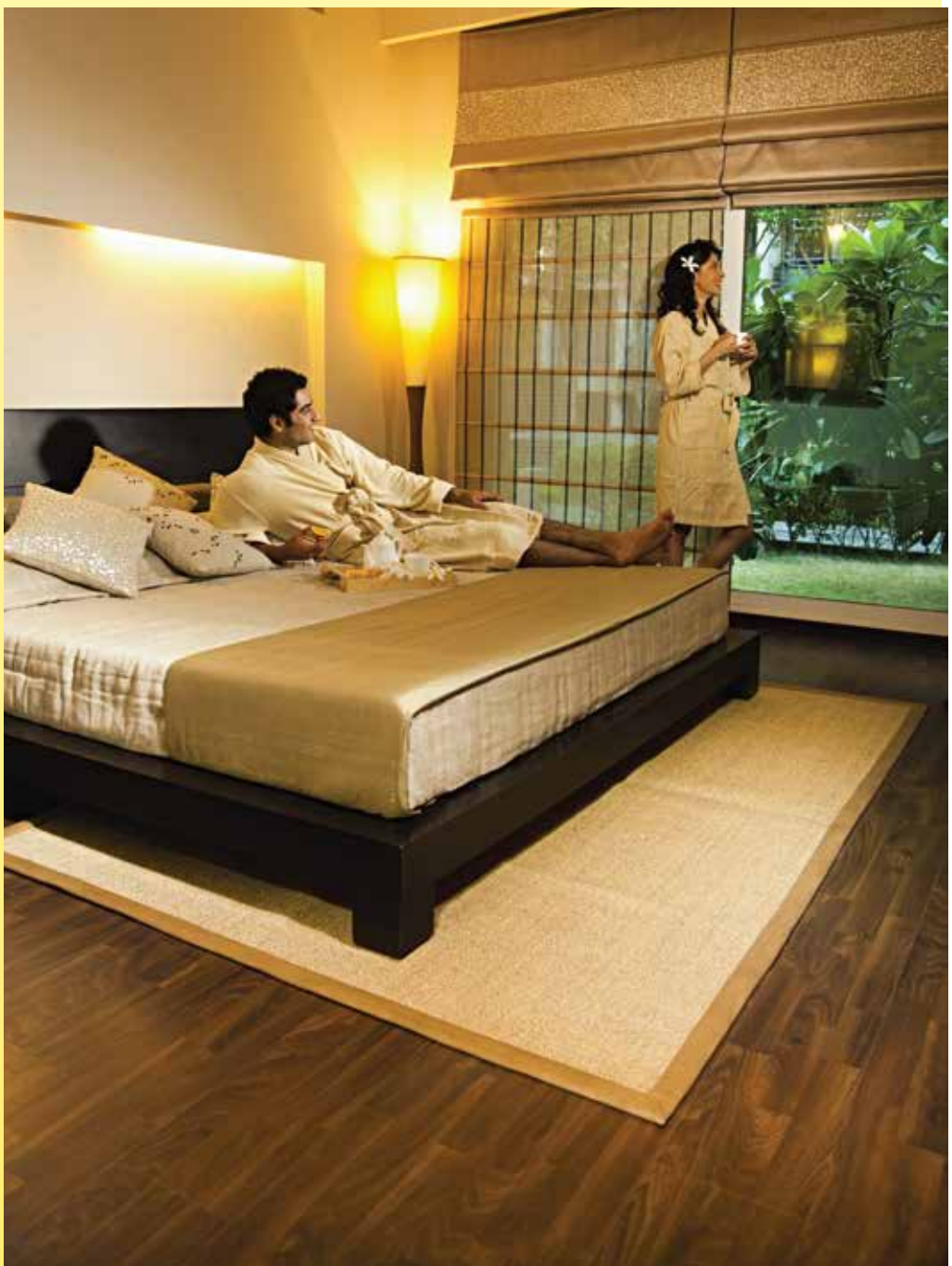
Laminated Wooden Flooring ▲