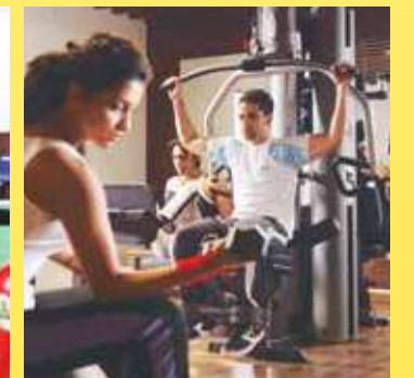
Fully-equipped gym with steam rooms