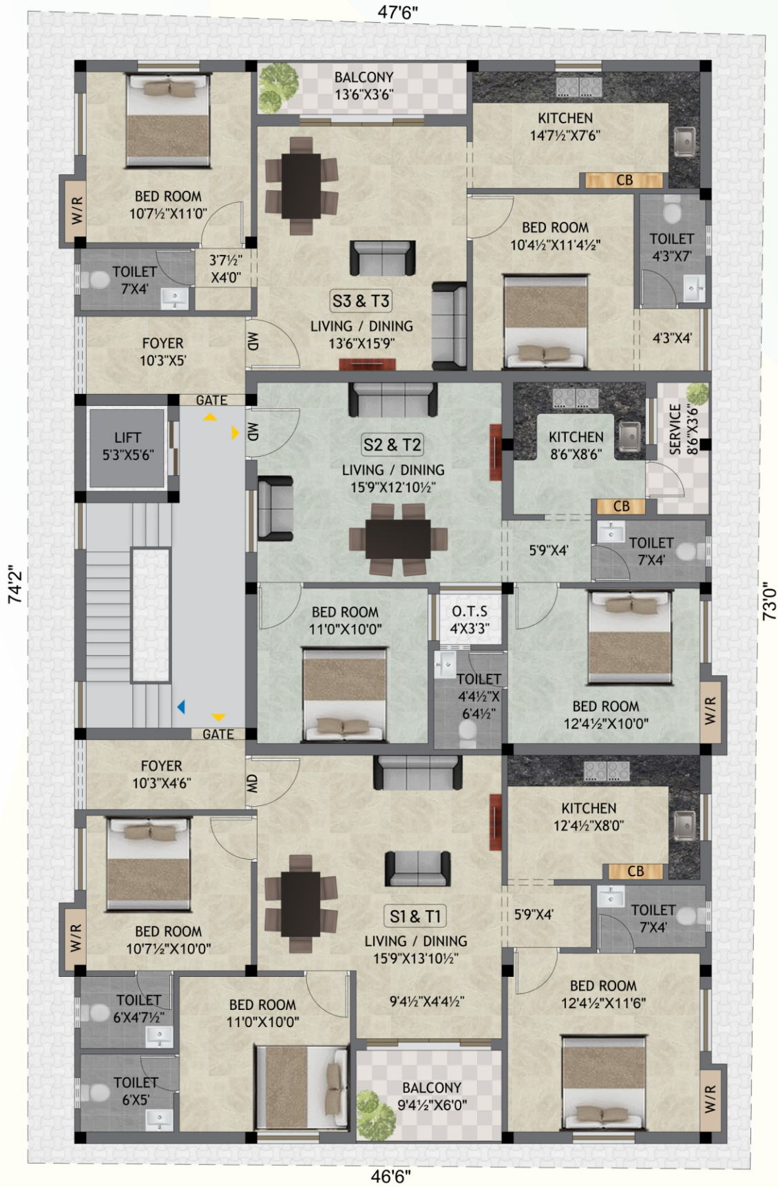
2nd & 3rd Floor Plan