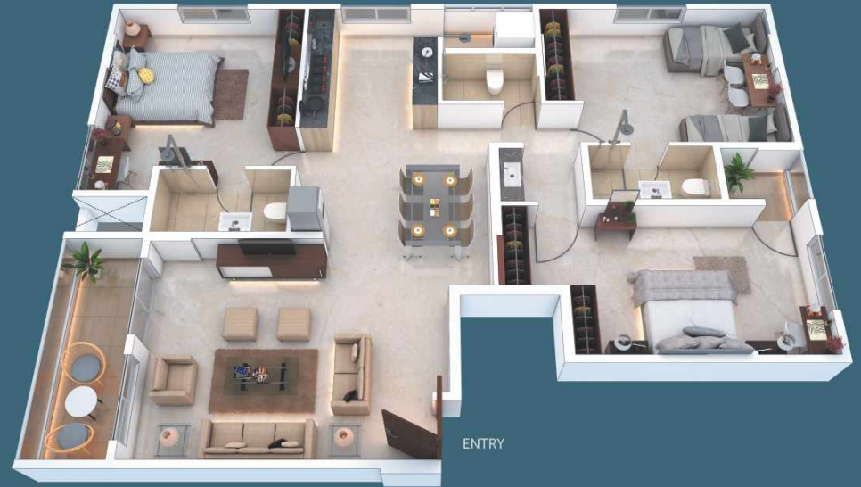
3 BHK- DIAMOND