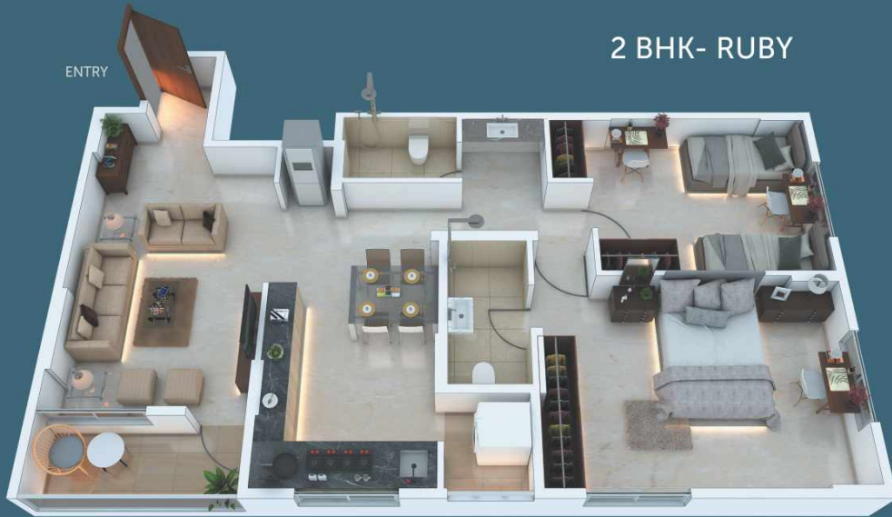
2 BHK- RUBY