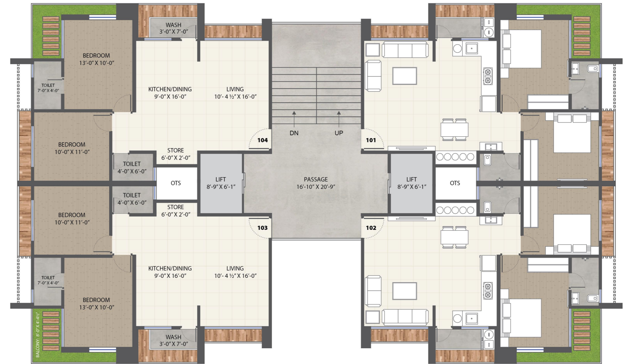
BUILDING : C & D | TYPICAL FLOOR PLAN