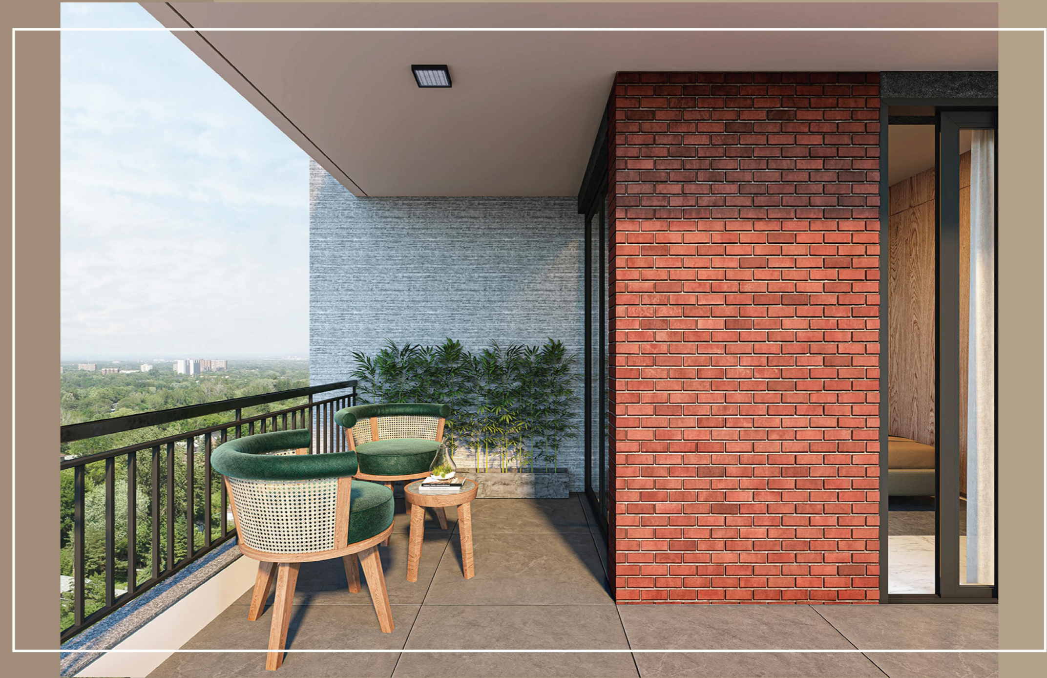
Watch the skies from your green, magnificent haven.