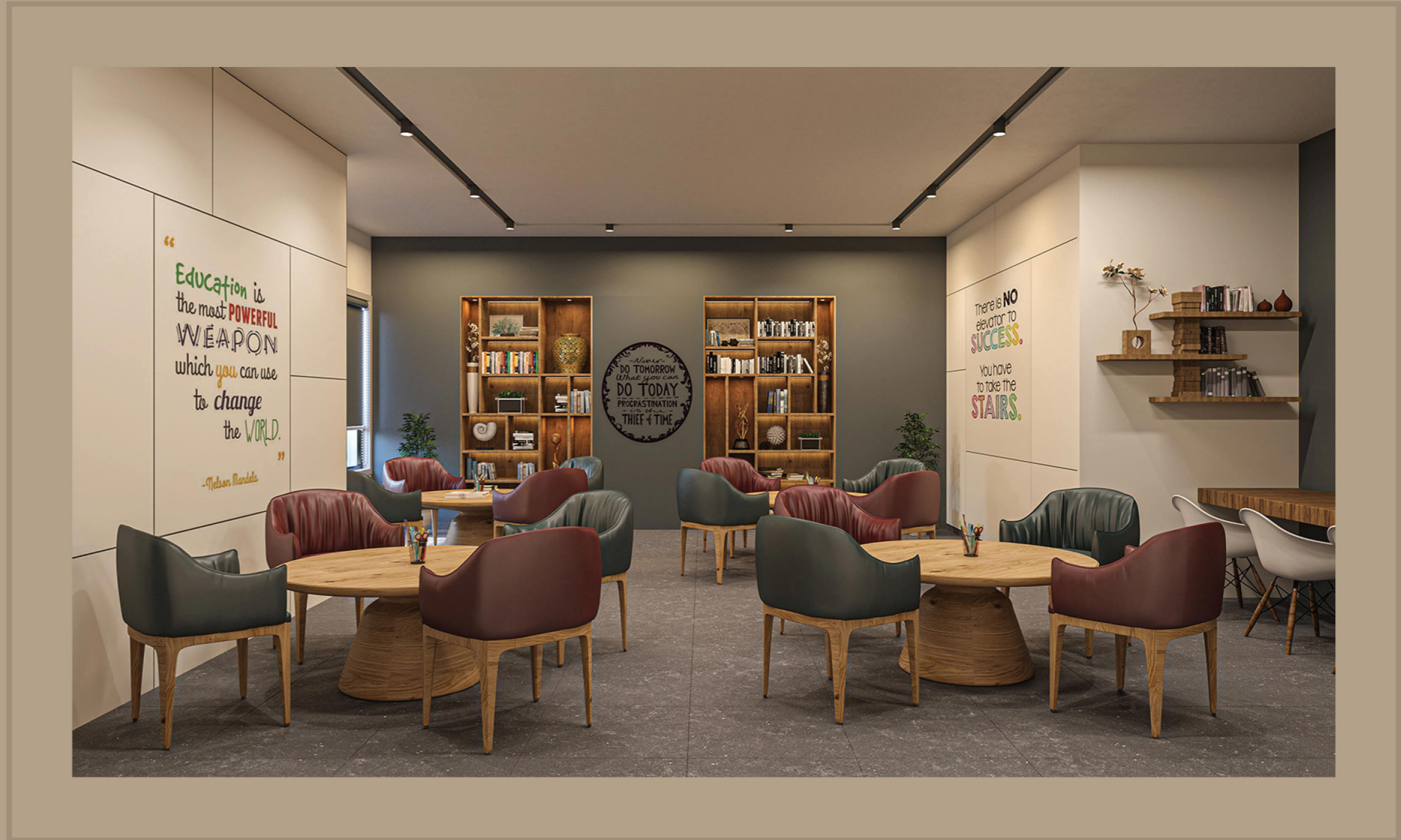
Classroom/Meeting Room - Experience a sense of well-being indoors.