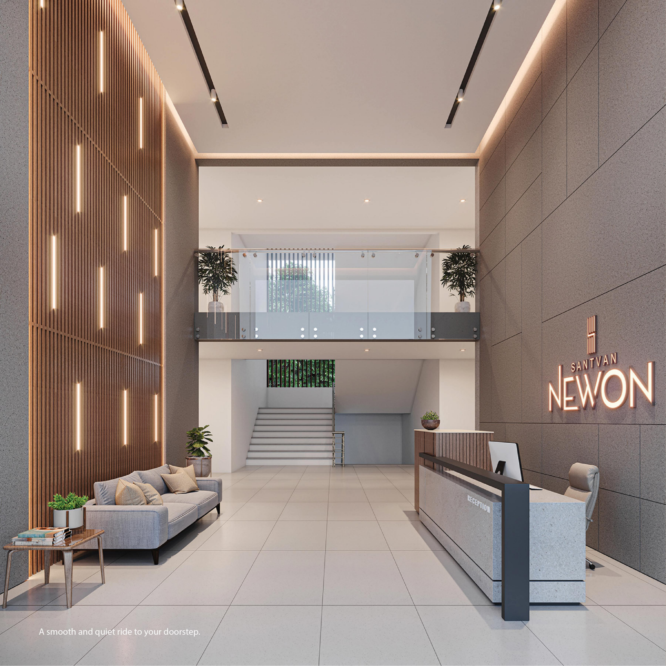
A smooth and quiet ride to your doorstep.