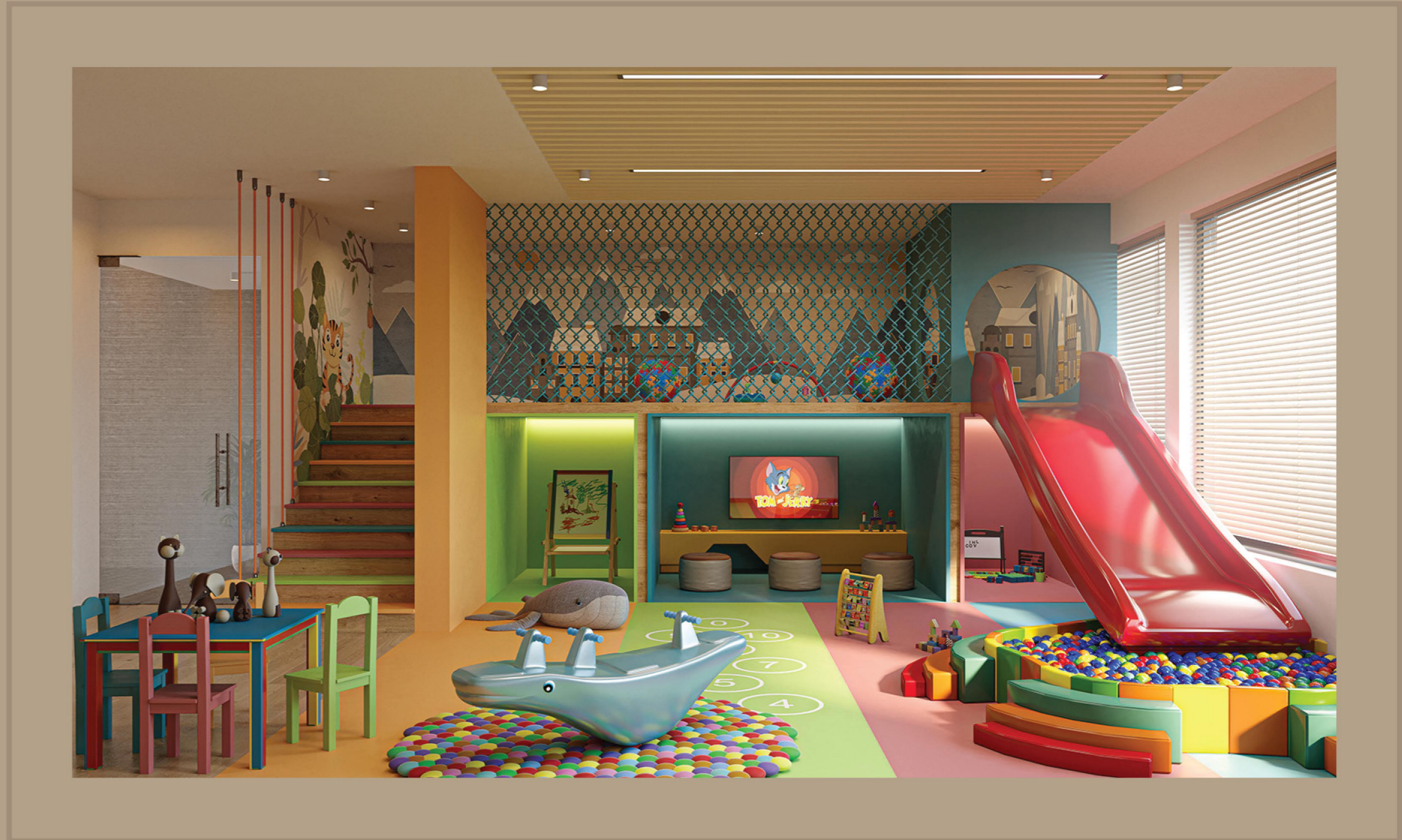
Everything you need and some more game for fun.