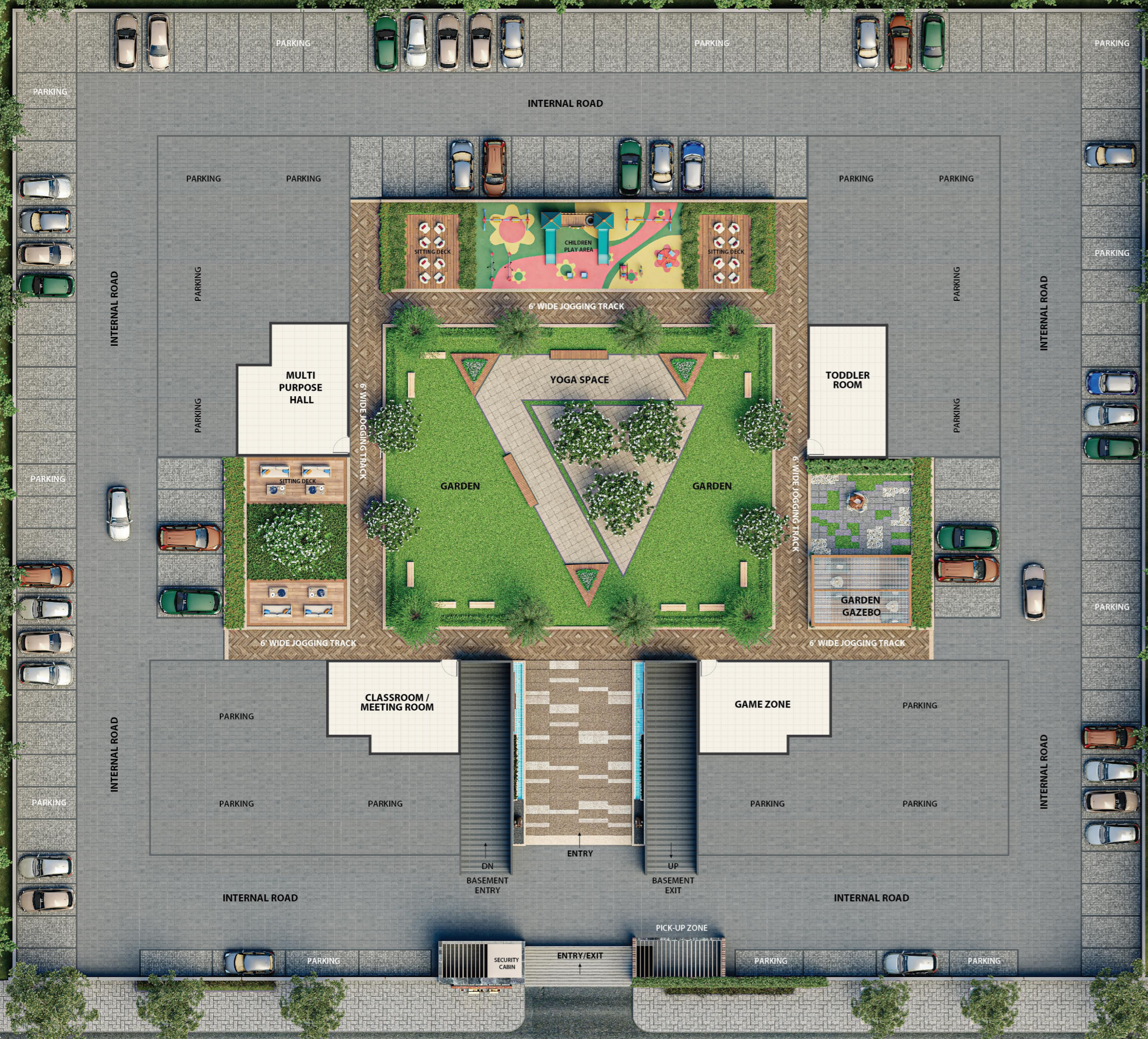
GROUND LAYOUT PLAN