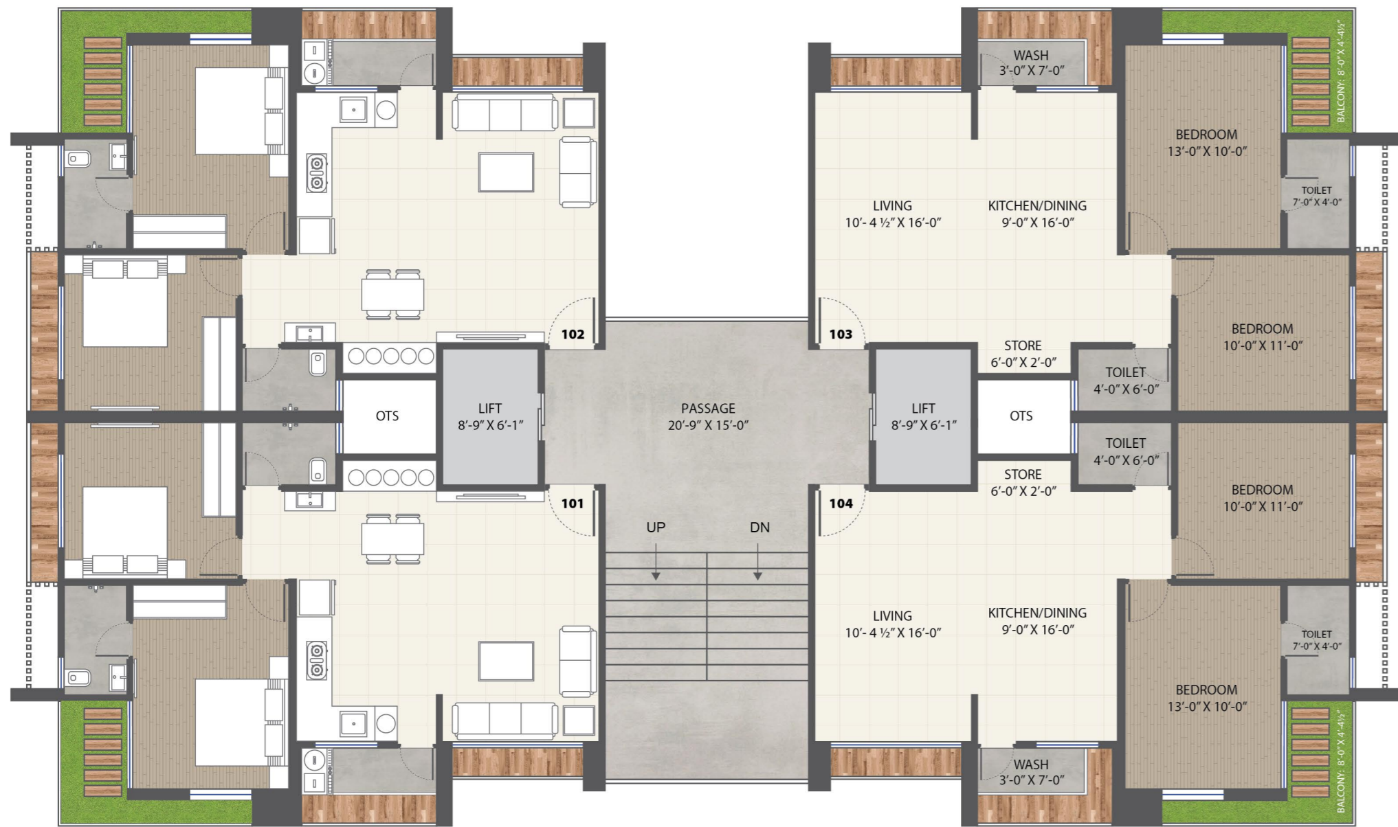
BUILDING : A & B | TYPICAL FLOOR PLAN