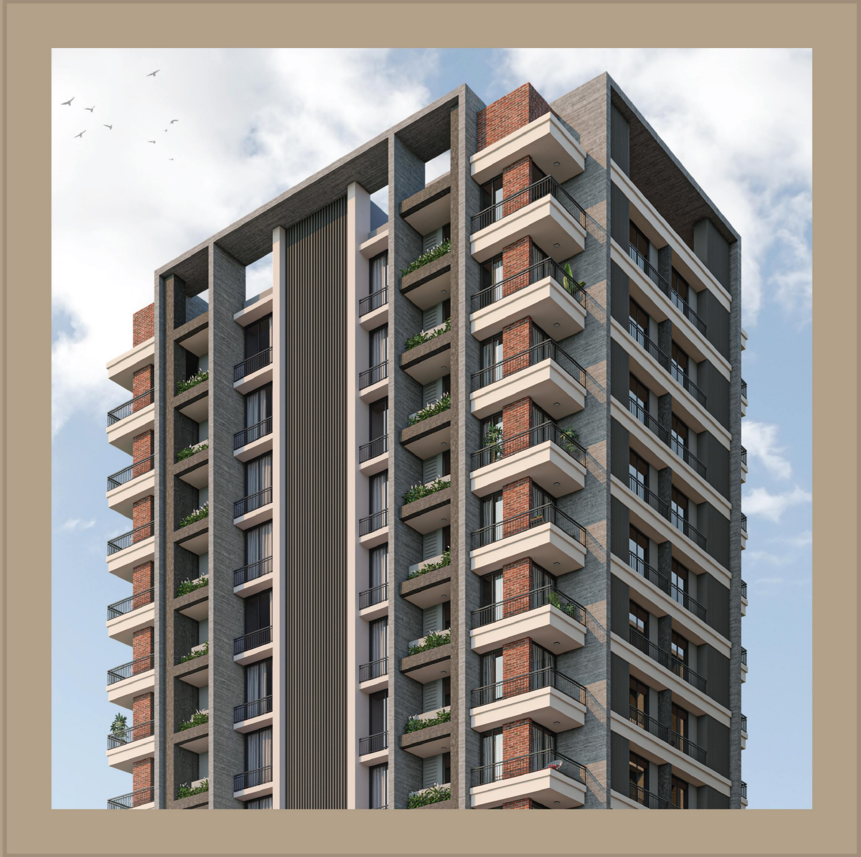
Newon of premier high-end for the stars