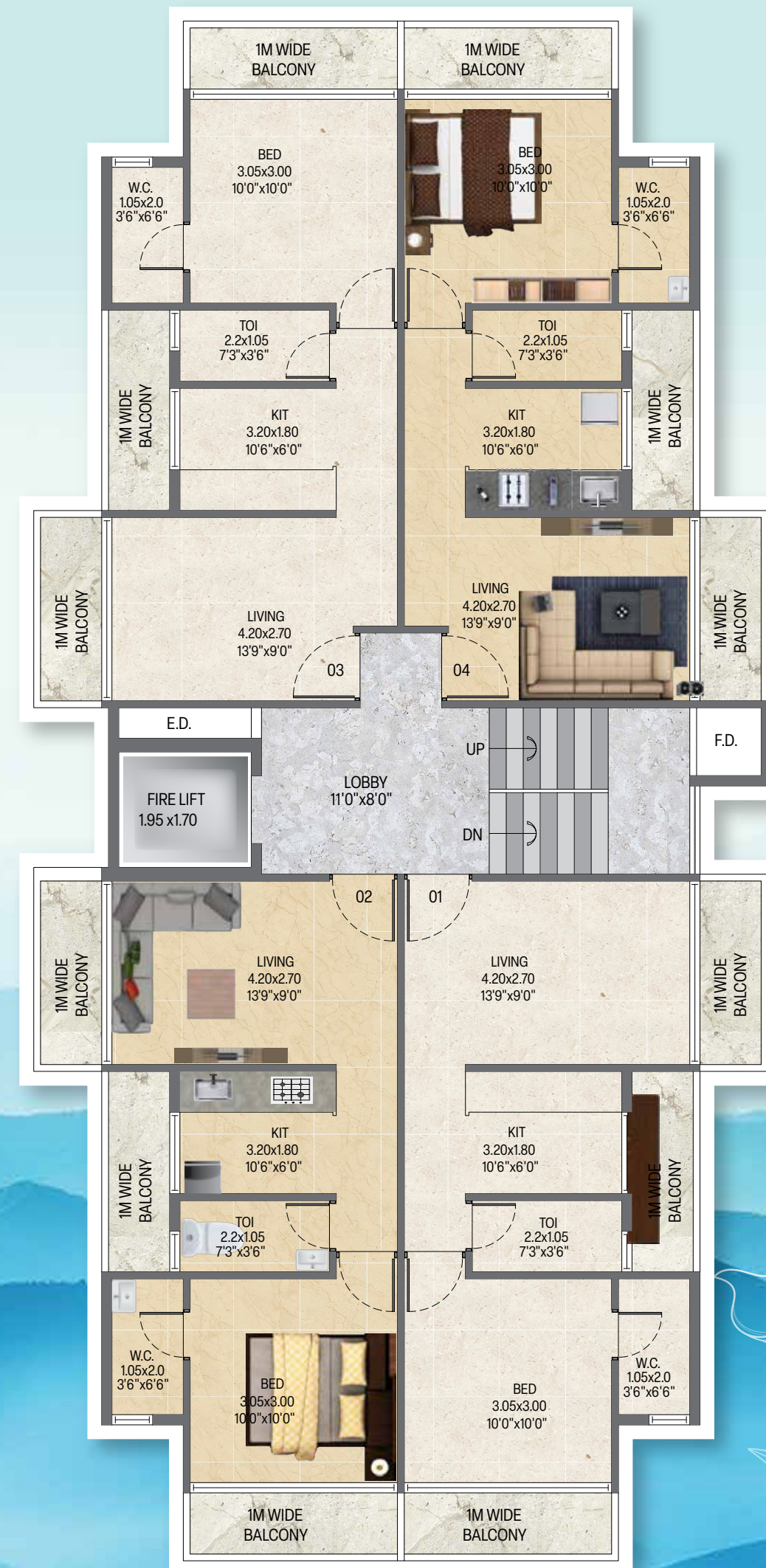
TYPICAL 1ST TO 7TH FLOOR PLAN