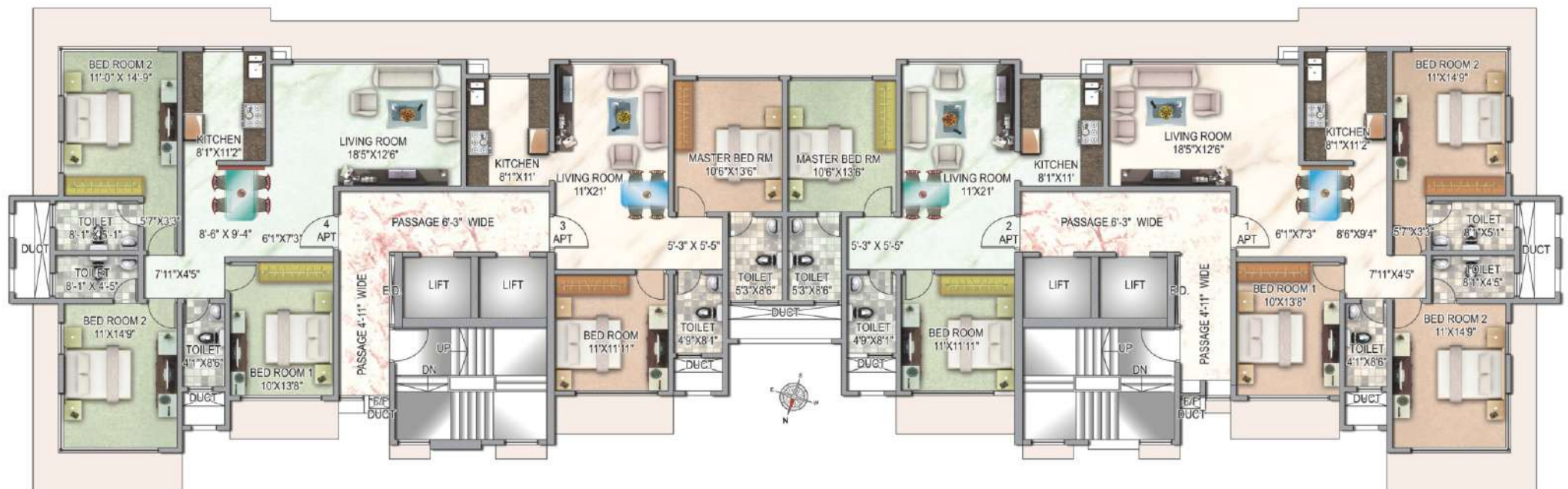
Apt. No. 4 Carpet Area : 1080 Sq.Ft. Dry Balcony Area : 54 Sq.Ft.