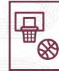
Half Basketball Court