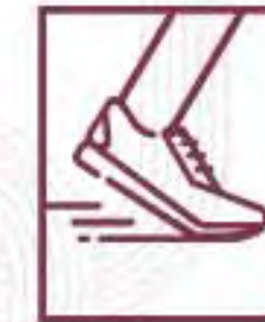
Jogging/ Bicycle Track