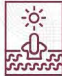
Infinity-edged Swimming Pool