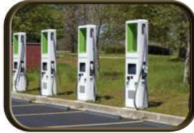
EV CHARGING POINT