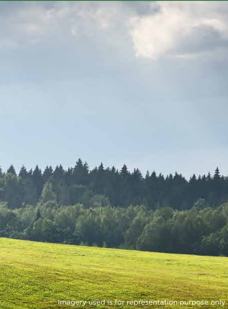
Imagery used is for representation purpose only

Purva Land, a new venture by Puravankara Group, presents the gateway for your dreams with unique plotted developments. Backed by decades of unrivalled expertise, the company lets you have a haven nestled within greenery on your own land. The various projects are designed as per your taste with world-class lifestyle amenities for you and your family.