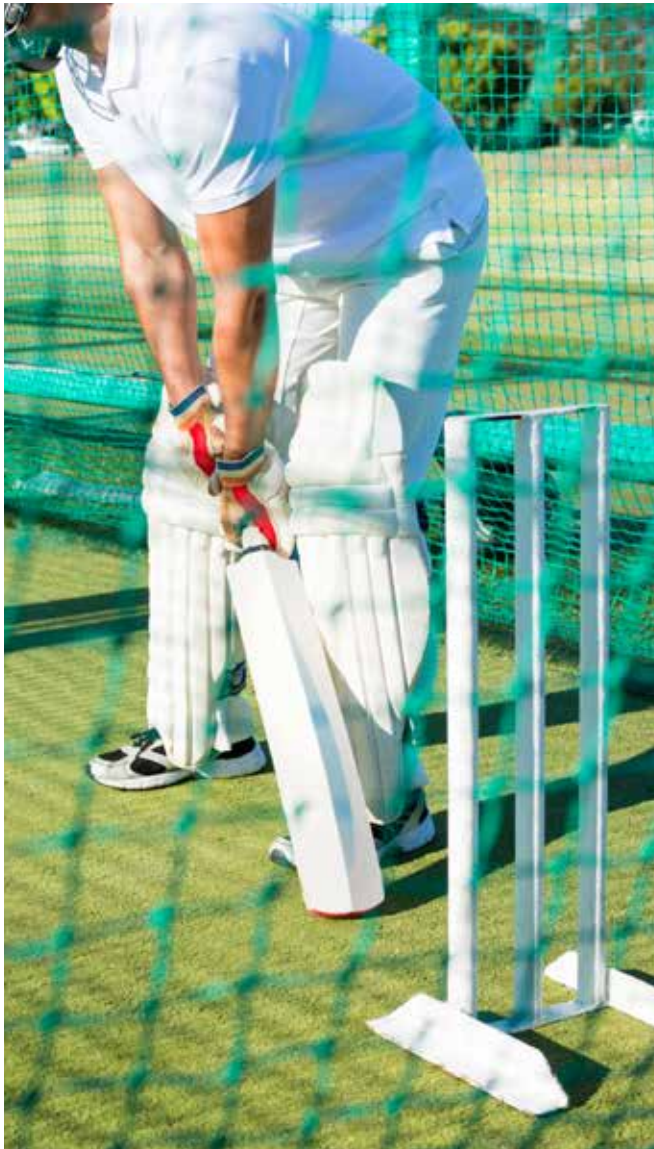
▲ Cricket Practice Net