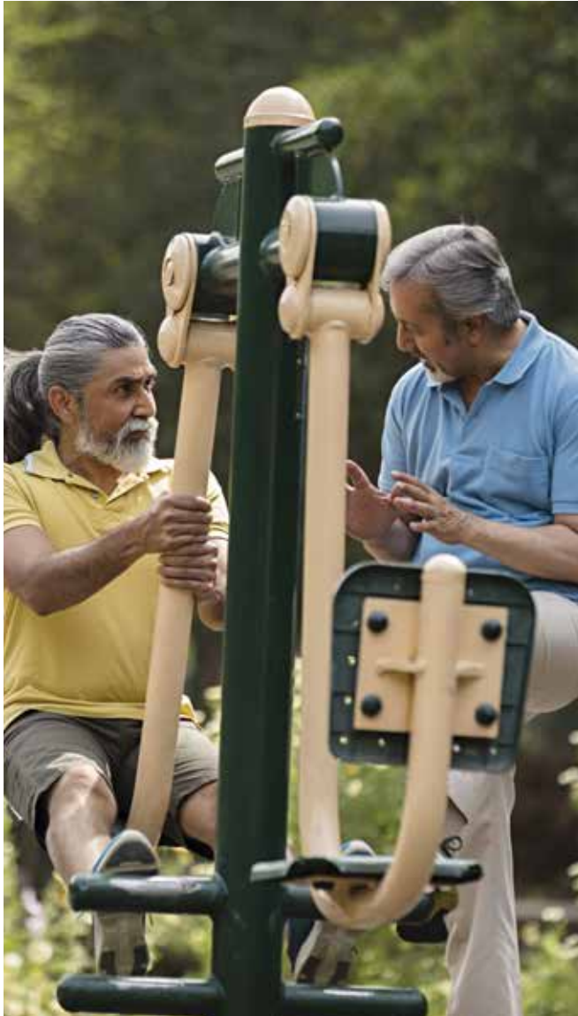
▲ Senior Citizens Outdoor Gym