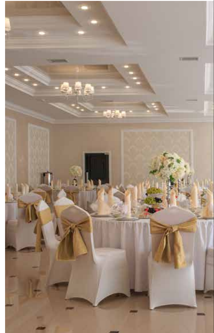
Party Hall With Pantry