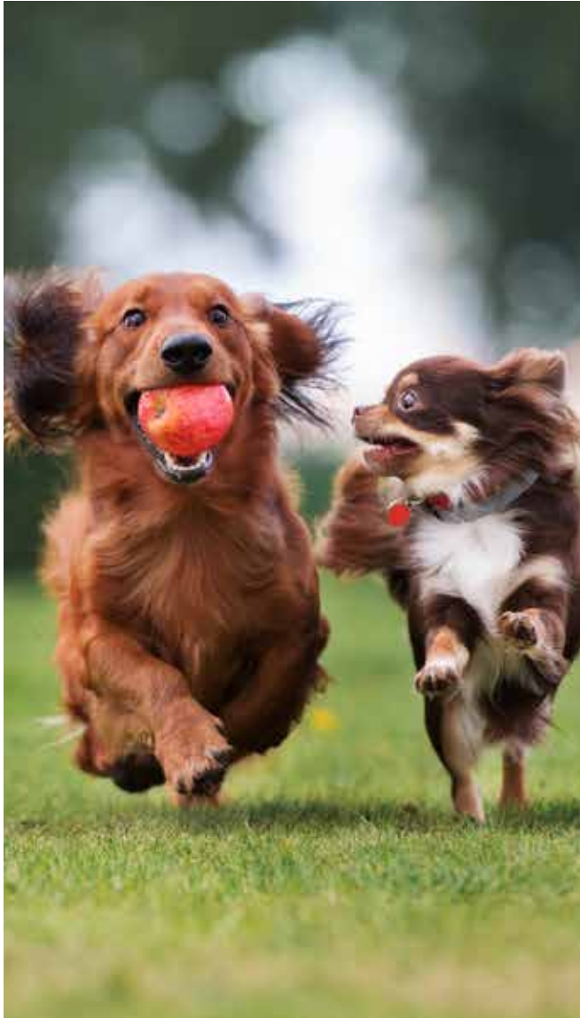
▲ Pet Park