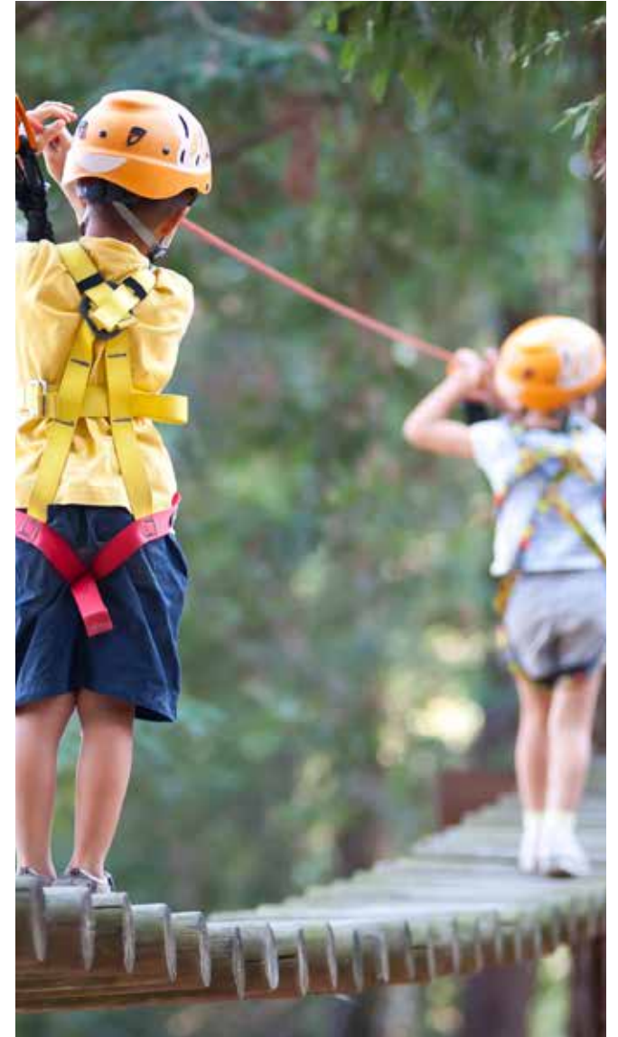
▲ Kids Activity Trail

Imagery used is for representation purpose only