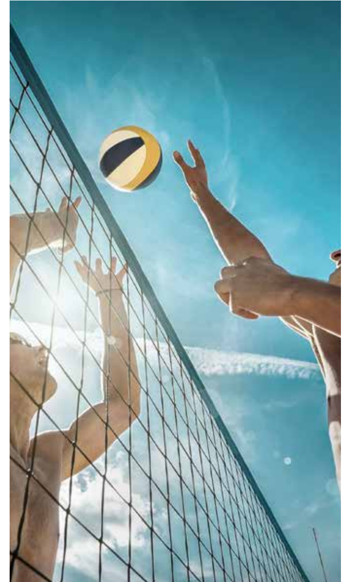
▲ Beach Volleyball Court

Imagery used is for representation purpose only