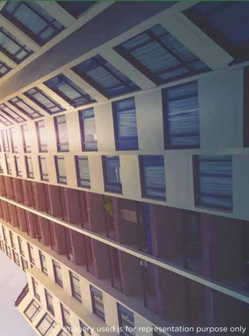
Imagery used is for representation purpose only

With a legacy of 45+ years, worth of stories, experiences, and happy homes, Puravankara Group is established as one of India's leading listed real estate companies, headquartered in Bengaluru.