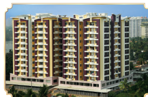
Galaxy Clifford Luxury 3 Bedroom Apartments Kadavanthra