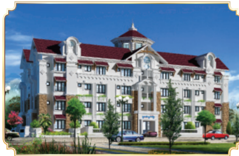
Galaxy Midwinter Luxury Apartments Kadavanthra