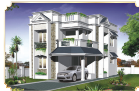
Galaxy Green Woods Luxury Villas Near Tripunithura