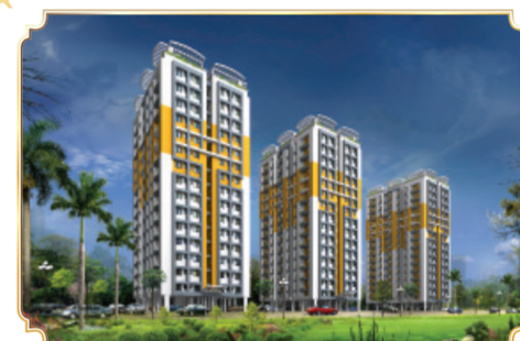
Galaxy Pine Court Luxury Apartments Near Infopark, Kakkanad