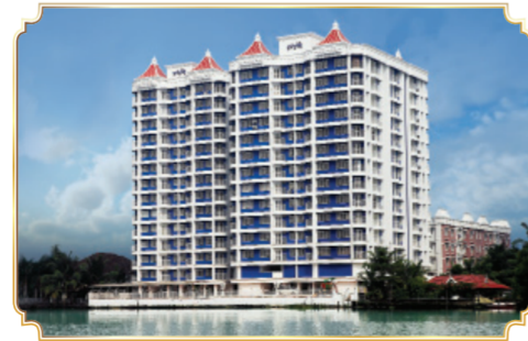
Galaxy Kingston & Galaxy Winston 3 Bedroom Waterfront Apartments Kadavanthra