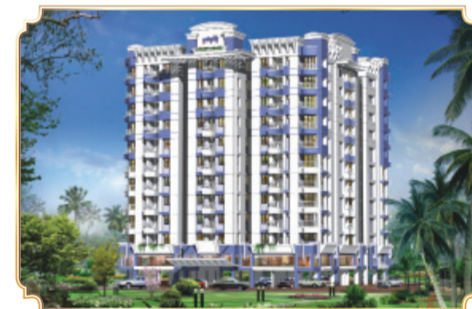
Galaxy Domain Premium 3 Bedroom Apartments Kakkanad