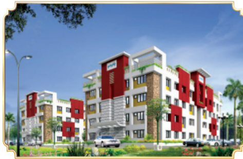
Galaxy Techno Valley Luxury Apartments Near SmartCity