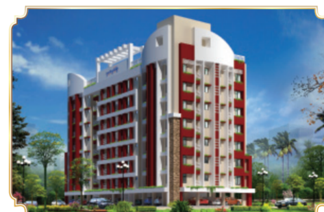
Galaxy Oxtan Luxury Apartments Kadavanthra