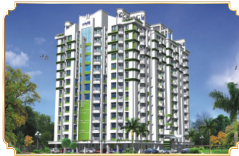
Galaxy Greens Premium 3 Bedroom Apartments Kakkanad