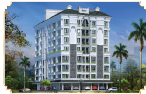
Galaxy Carlton Luxury Apartments Kadavanthra