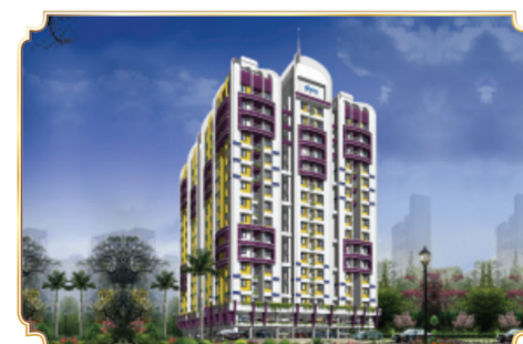
Galaxy Cloud Space Premium Apartments Near Infopark, Kakkanad