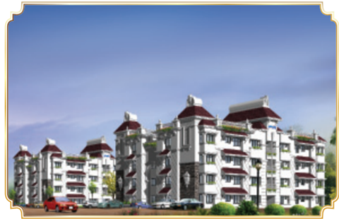
Galaxy Castello Luxury Apartments Opposite to Gold Souk Grande