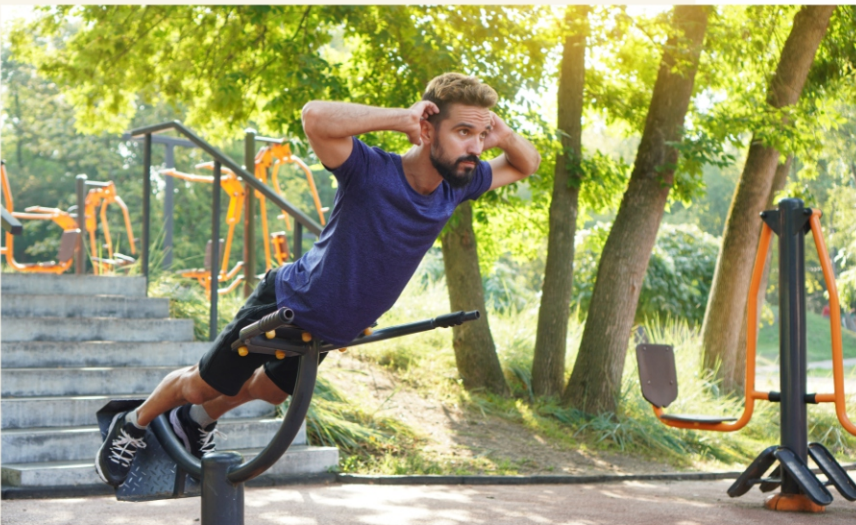
Outdoor Gym Area