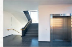
LIFT LOBBY AND STAIR