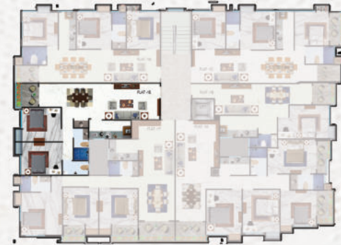
Flat - 1E Key plan