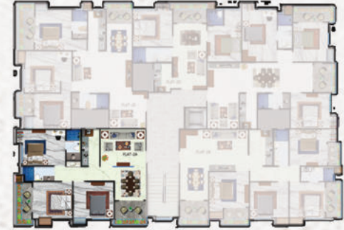
Flat - 2A Key plan