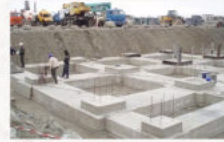
FOUNDATION AND STRUCTURE

Floor: Anti skid ceramic tiles Wall: Ceramic tiles upto 7 feet height Water proofing on wall & floor Ceiling: Putty Geyser: Geyser point in all toilets Sanitary Ware : Good quality make CP Fitting : Good quality make