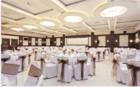
AC Community Hall