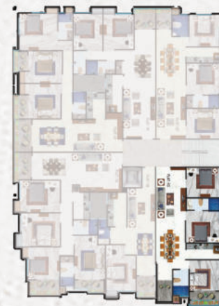
Flat - 1C Key plan