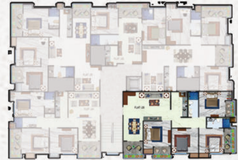
Flat - 2B Key plan