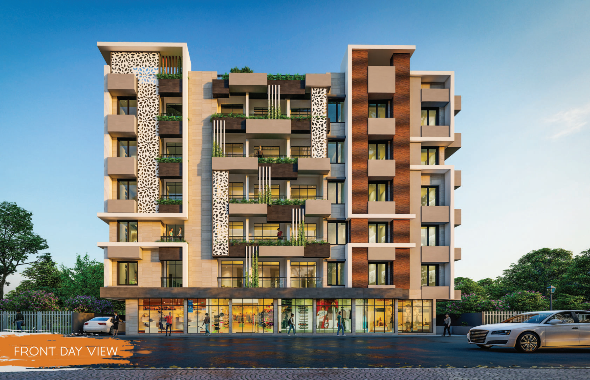
FRONT DAY VIEW