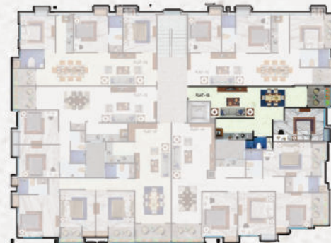
Flat - 1B Key plan