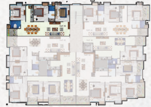
Flat - 1D Key plan