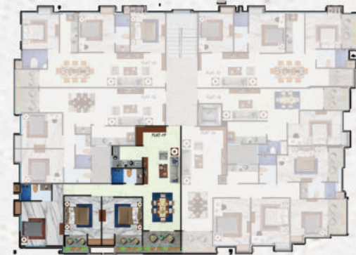
Flat - 1F Key plan