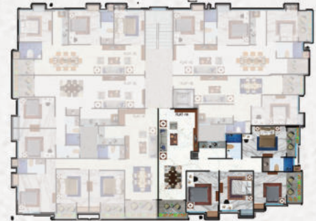
Flat - 1A Key plan