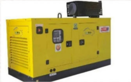
24 Hrs Power Supply