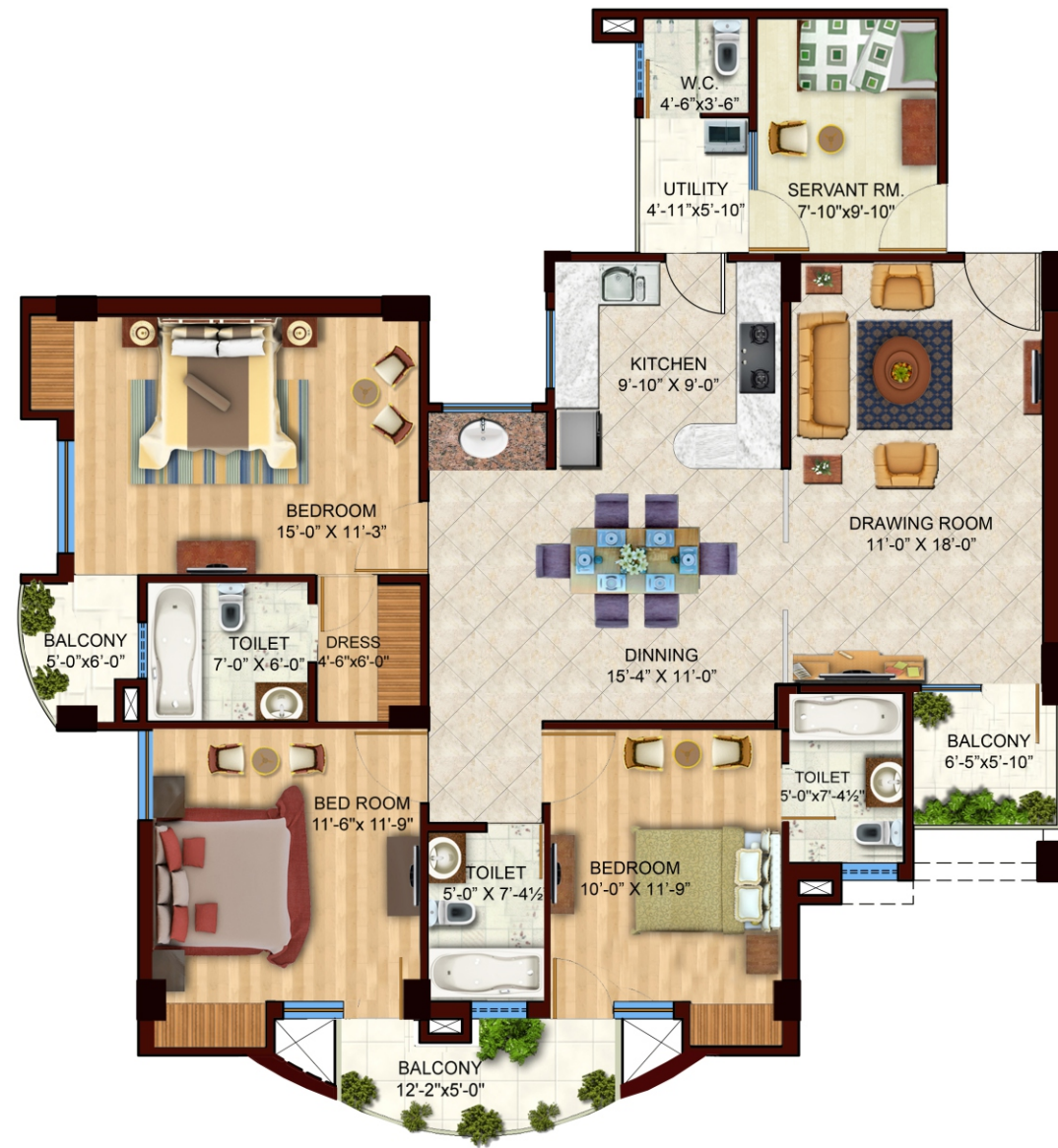
TYPE - I THREE BHK FLAT (WITH SERVANT) SUPER AREA AREA - (1769 Sq.Ft.)