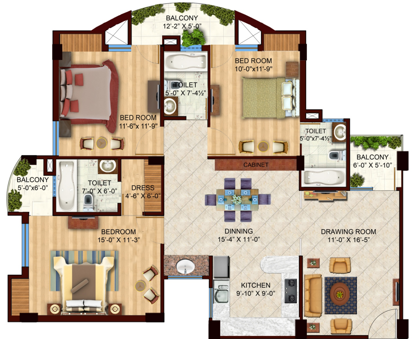
TYPE - II THREE BHK FLAT SUPER AREA AREA - (1573 Sq.Ft.)