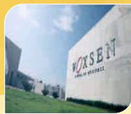
WOXSEN INTERNATIONAL UNIVERSITY