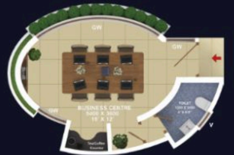
Business Centre Plan

Because true luxury is not just about where you live, but how effortlessly you balance work, family, and yourself.