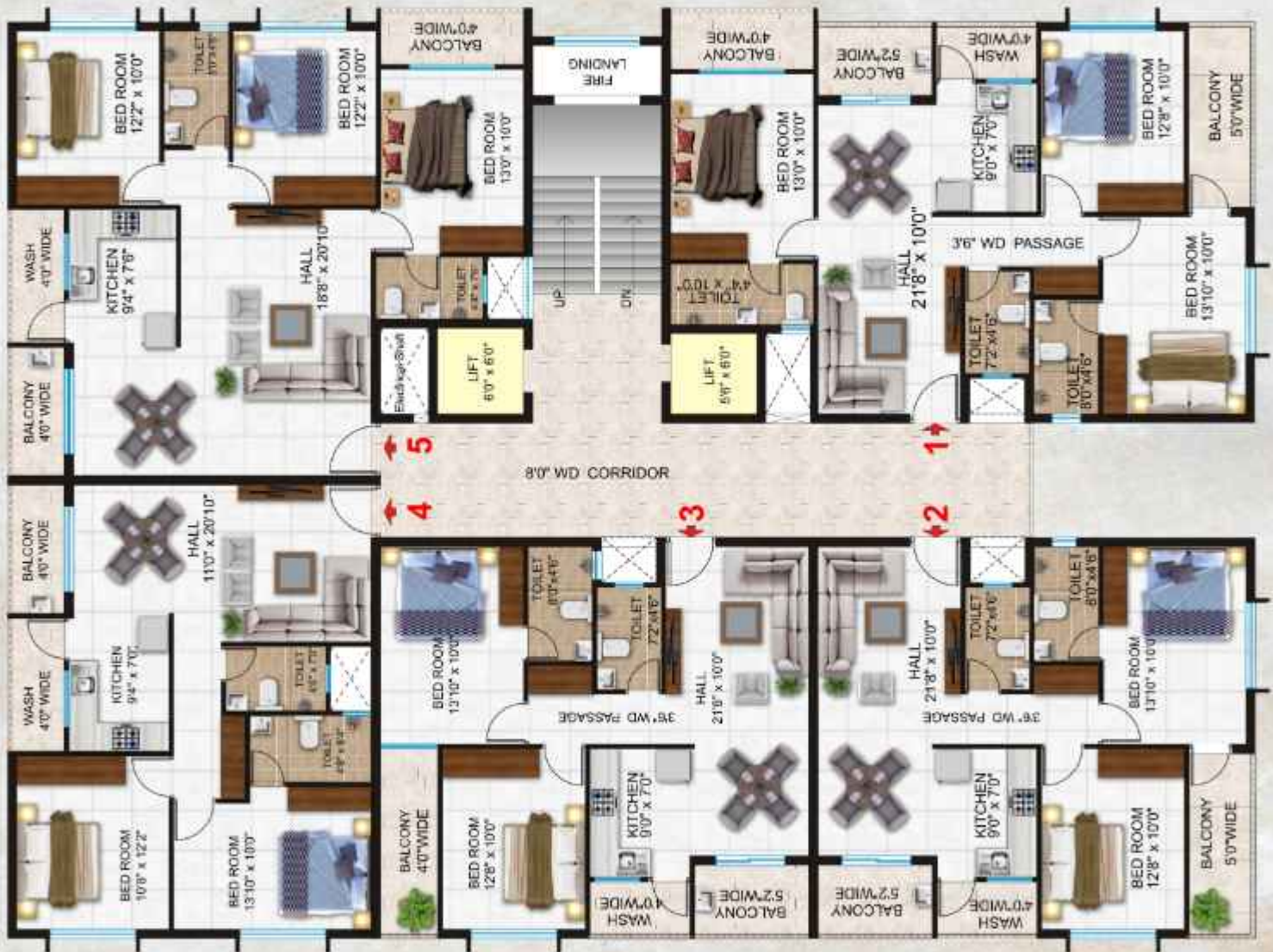
2 BHK FLAT NO.4 SBUA-1000 Sqft