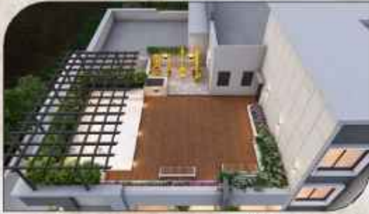
Terrace Top View