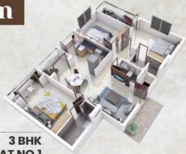
3 BHK FLAT NO.1 SBUA- 1340 Sqft