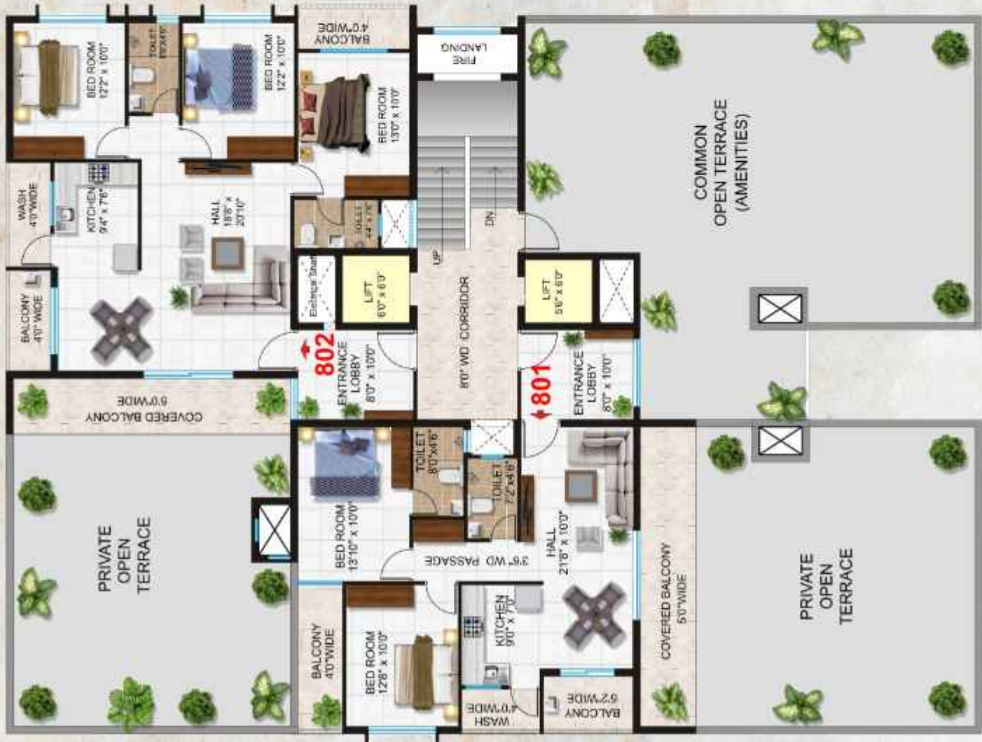
3 BHK Pent House Flat No. 802 SBUA-1550 Sqft