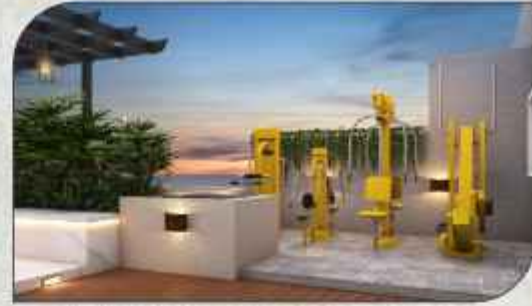
Terrace Open Gym