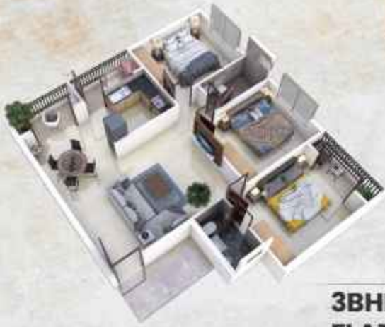
3BHK FLAT NO.5 SBUA-1280 Sqft