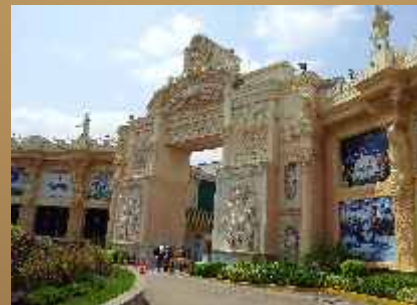
Innovative Film City