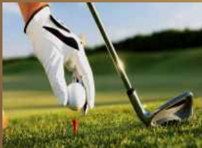
International Golf Course