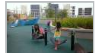
CHILD PLAY AREA