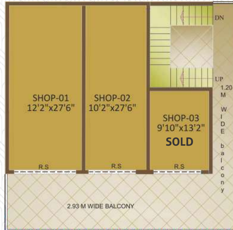
First Floor Shops