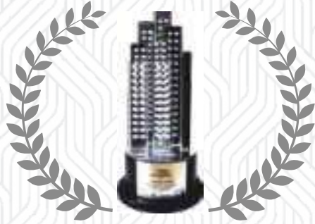
Avinash Pride Best Project in LIG Category PMAY Empowering India Awards 2019