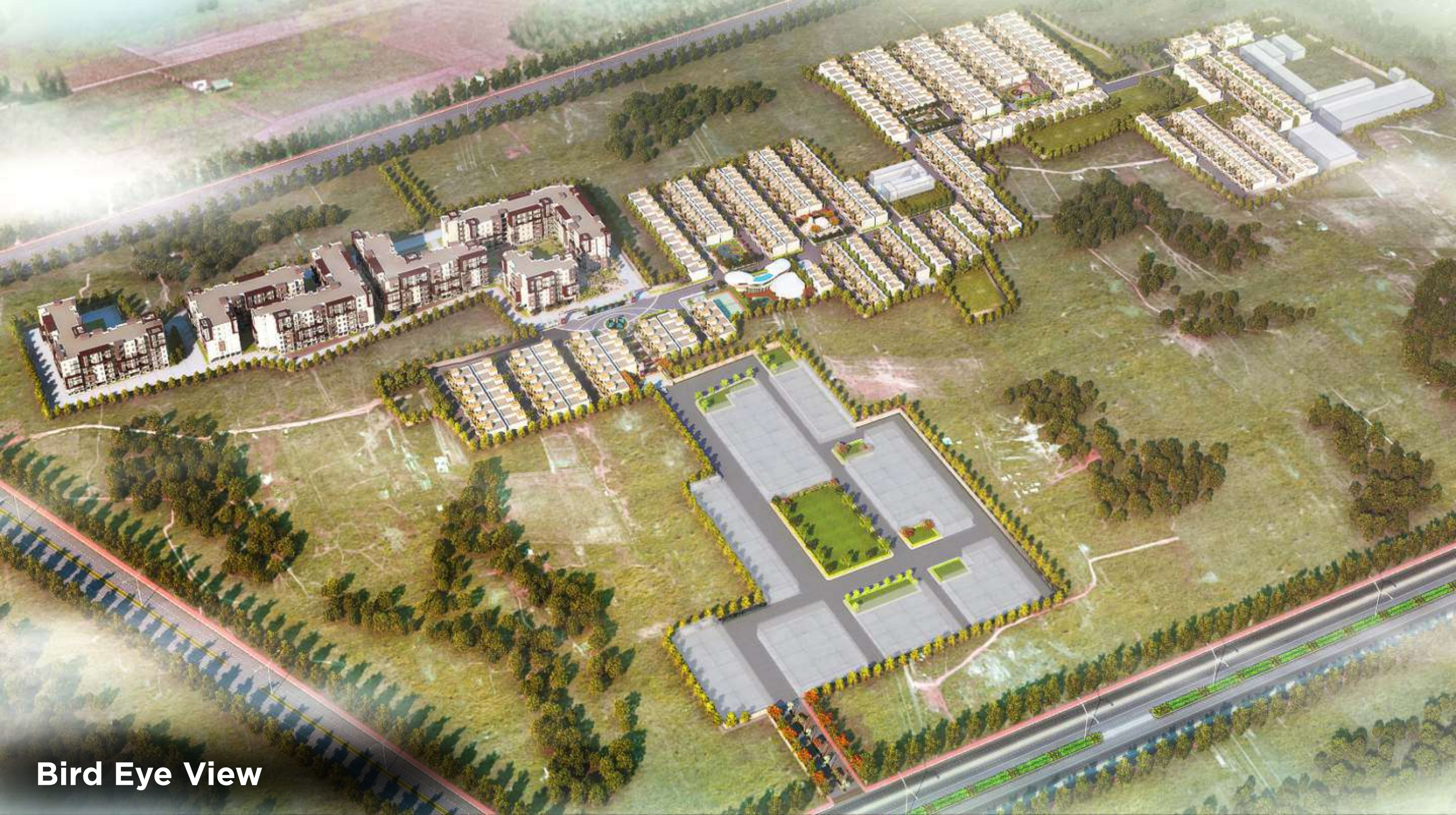
Bird Eye View