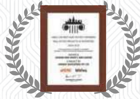
Avinash New Country ASIA's 100 Best Awarded Projects 2014-15