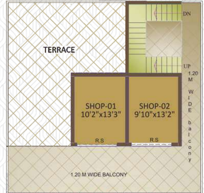
Second Floor Shops