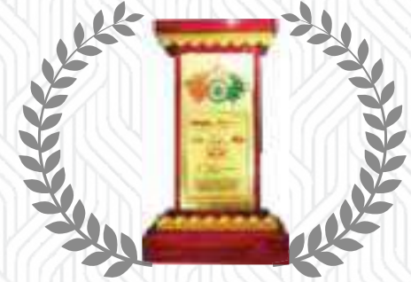
Avinash Group Women Empowerment & Gender Equity CSR Award 2017