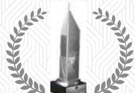
Magneto The Mall Best Commercial Property in Eastern Region CNBC Awaaz-CREDAI Real Estate Awards 2010