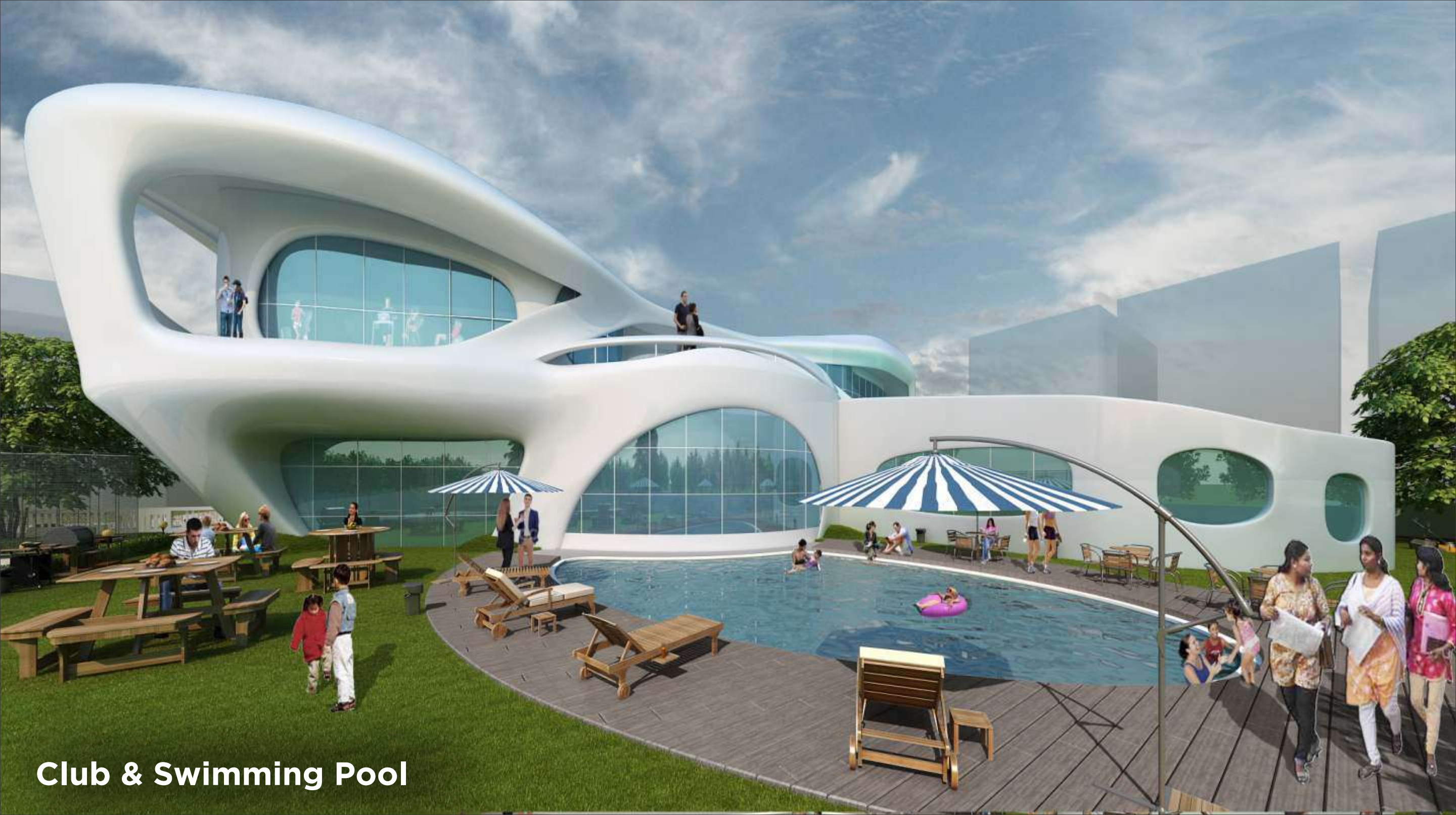
Club & Swimming Pool