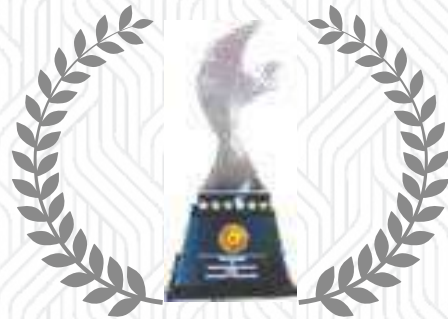
Maruti Lifestyle 6 Star Rated Project In Central India CRISIL 6 Star Rating