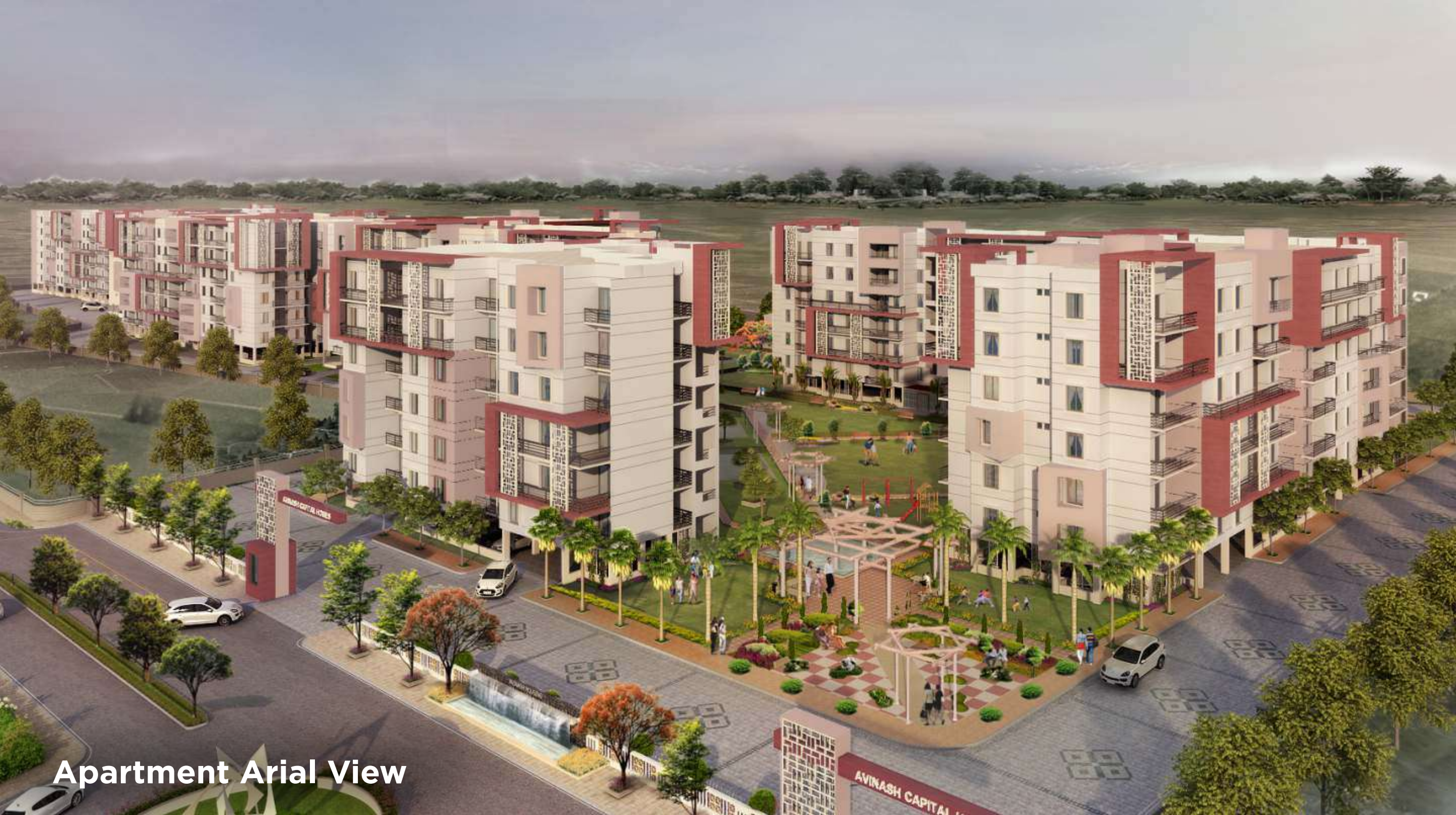
Apartment Arial View