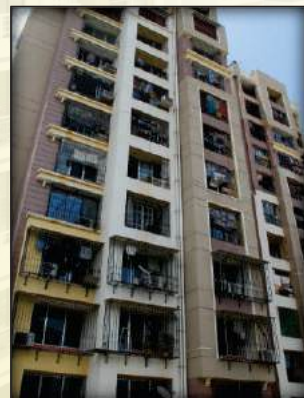
Vedant, Unnat Nagar Goregaon (W)