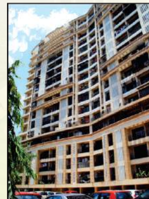
Pramukh Heights, Andheri (W)