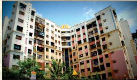
Prathmesh Park, Andheri (W)