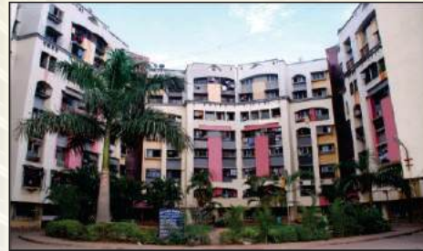
Silent Park, Mira Road (E)