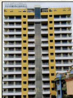
Nakshatra Tower, Mira Road (E)