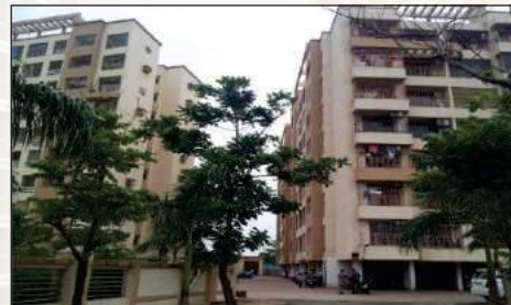
Garden Court - Bhayander (W)