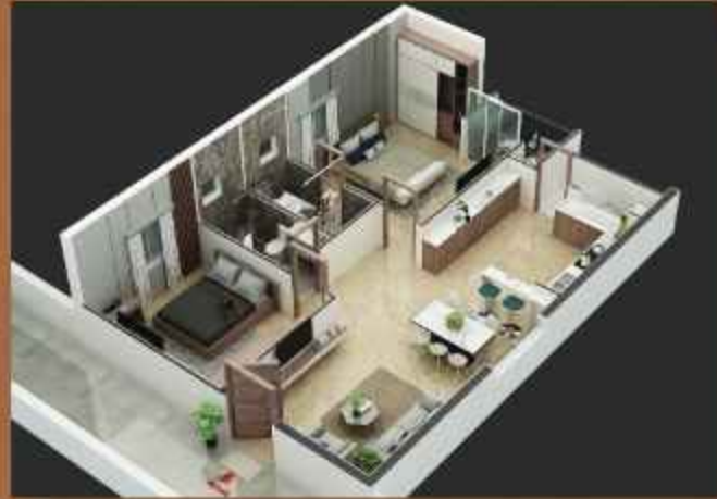
Flat No's.10,11,22 1215 SFT | 2BHK North Facing