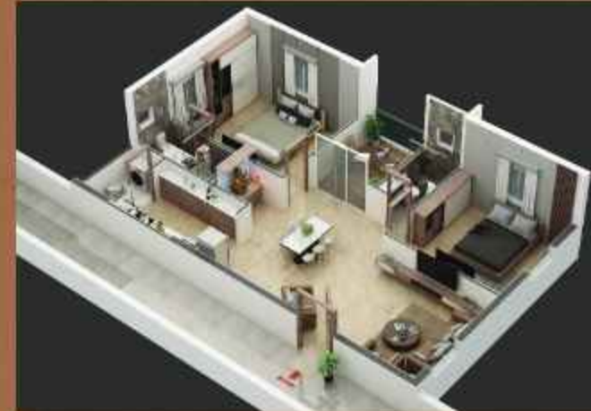
Flat No.06 | 1310 SFT | 2BHK East Facing