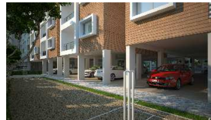
cricket area view