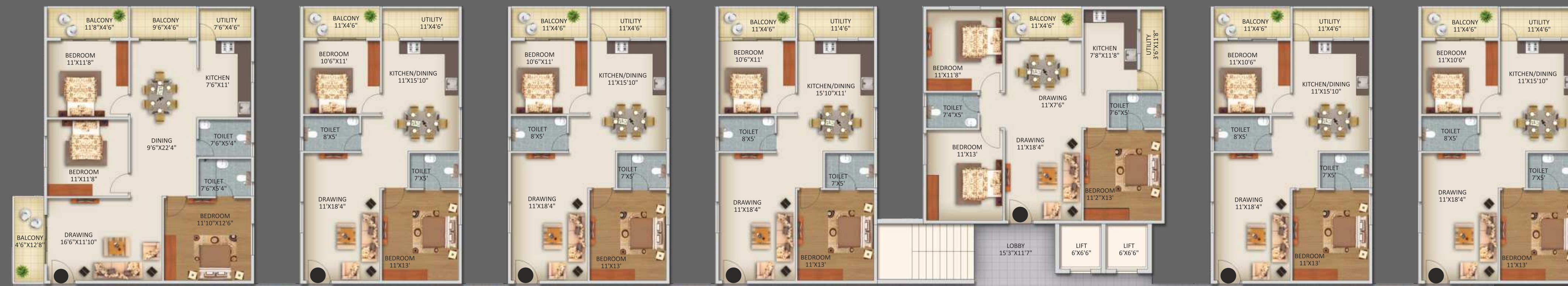
6'7" WIDE CORRIDOR