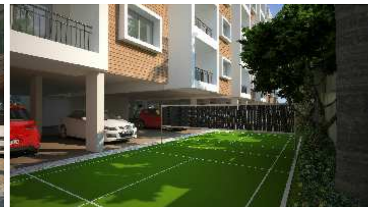
badminton court view