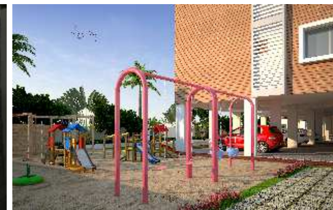
kids play area