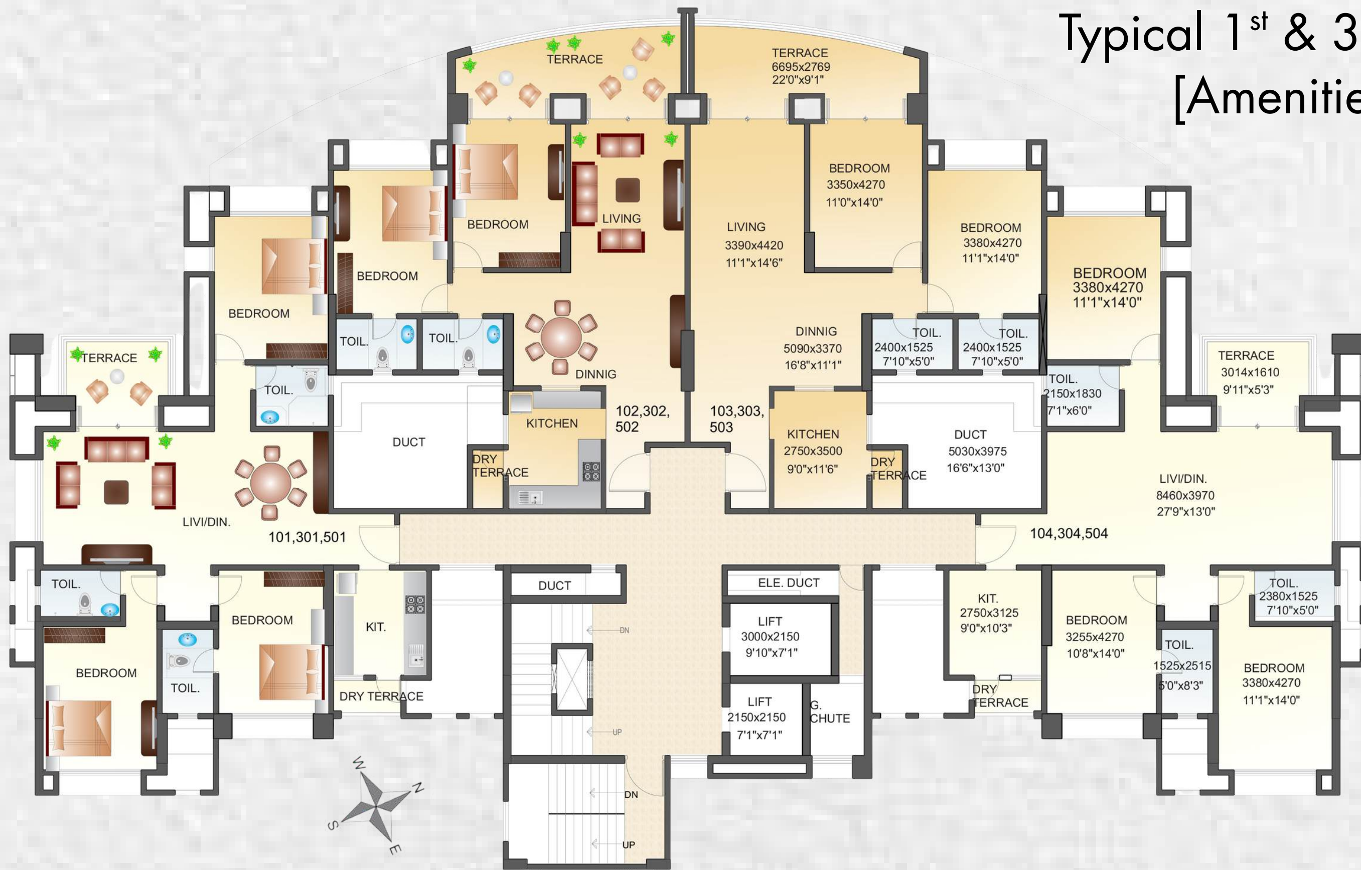
As Per MAHA RERA KONDHWA - 'C' bldg. 1 st & 3 rd Floor