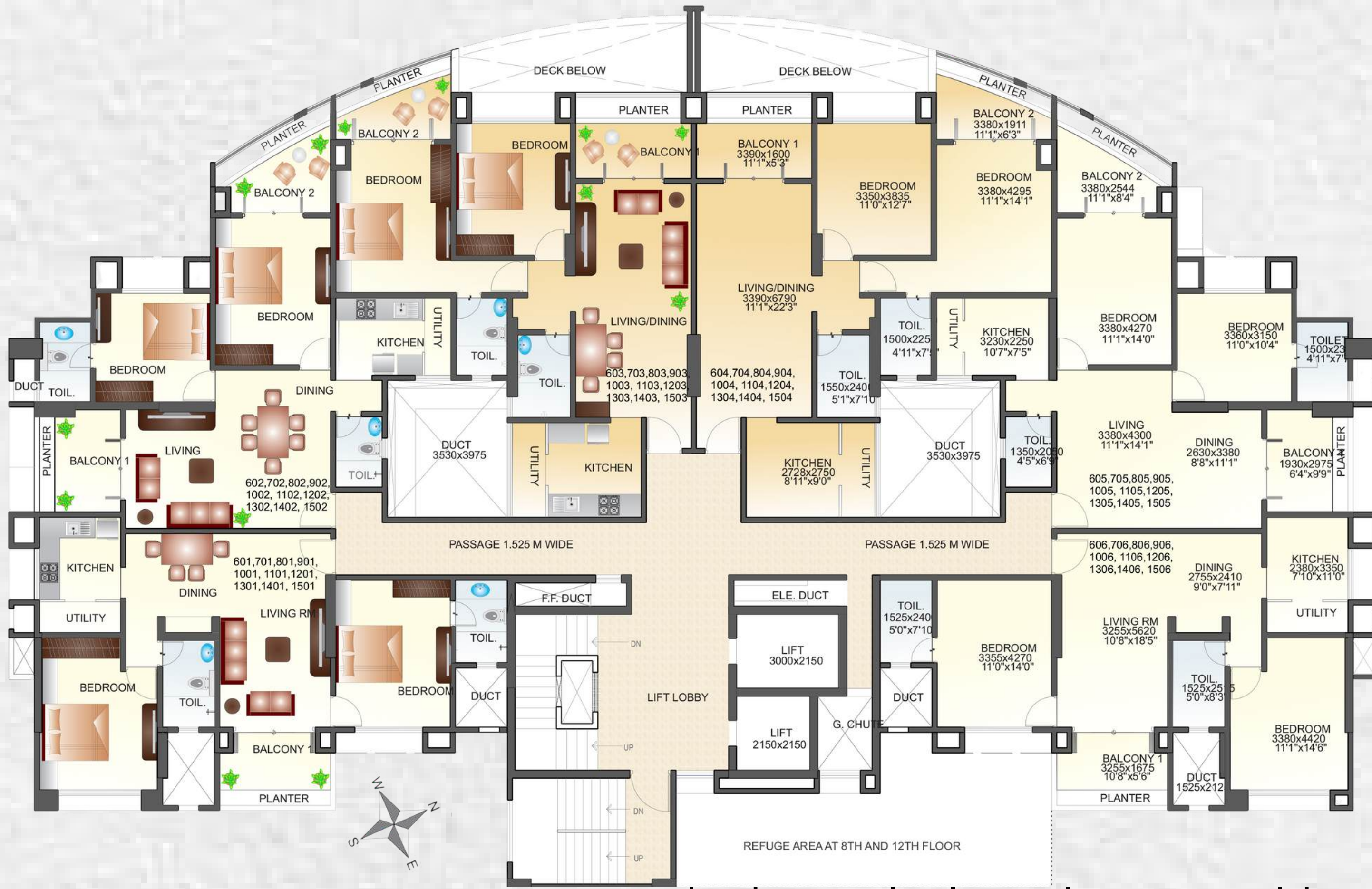
Typical 6th - 10th Floor Plan For Building C