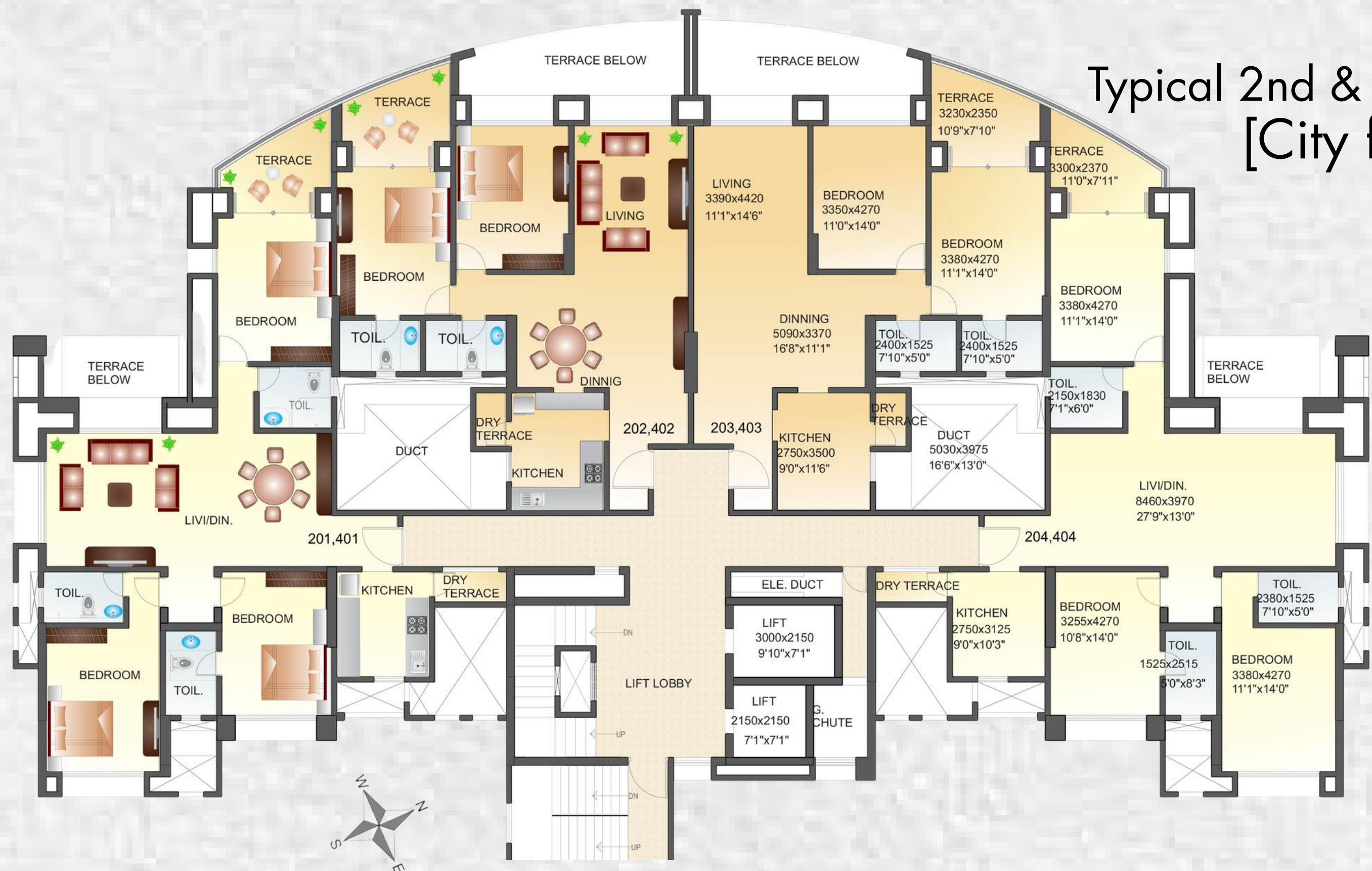
As Per MAHA RERA KONDHWA - 'C' bldg. 2 nd & 4 th Floor