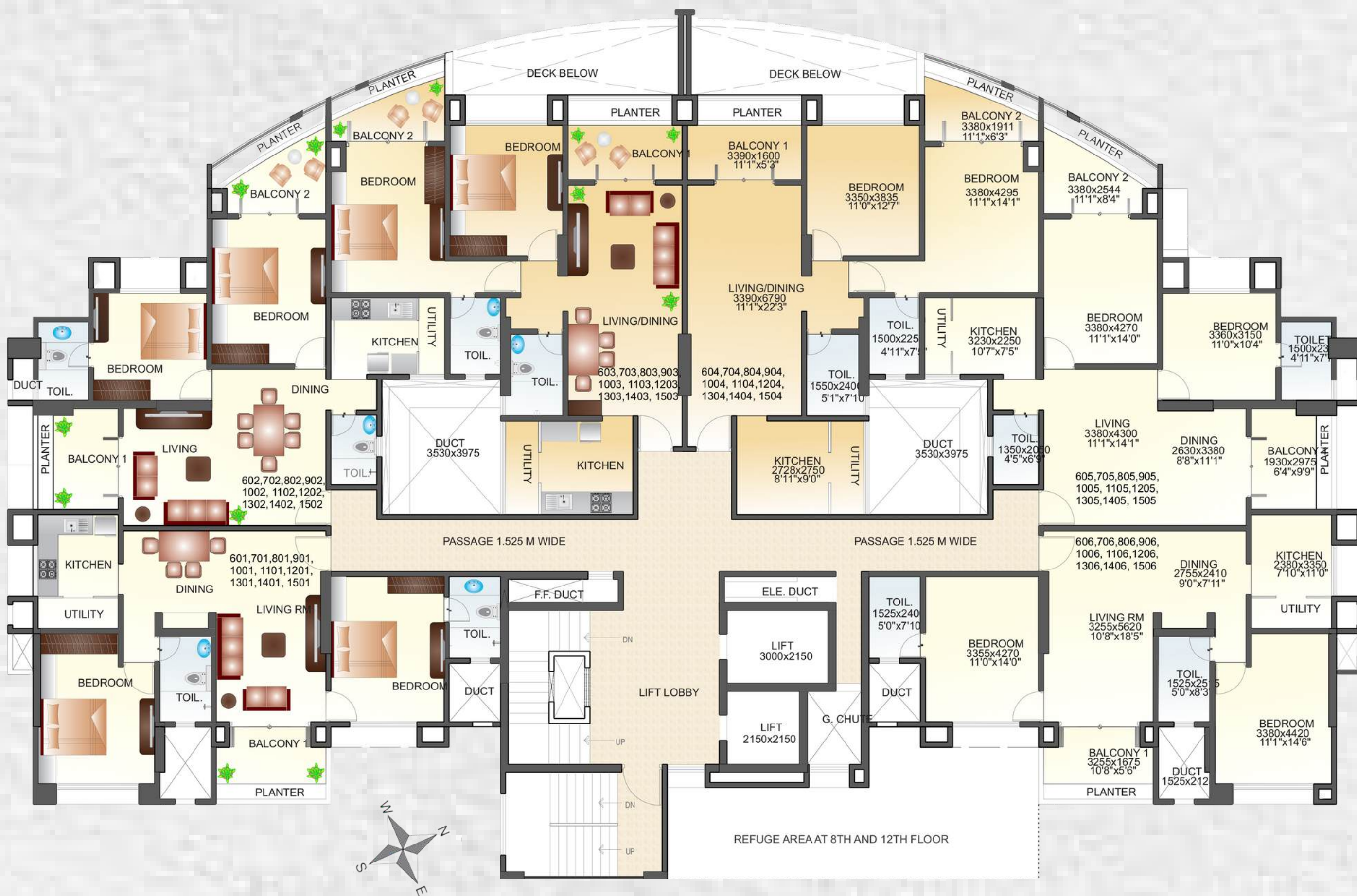
Typical 11th - 15th Floor Plan For Building C