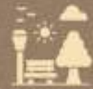
SEATING GARDEN WITH LANDSCAPE