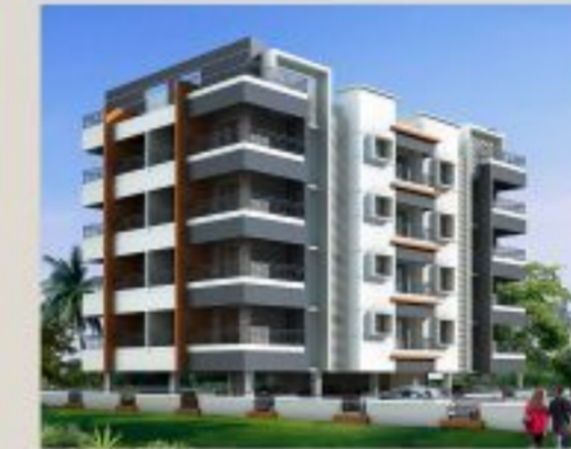
Agraja Shilas Mangalore