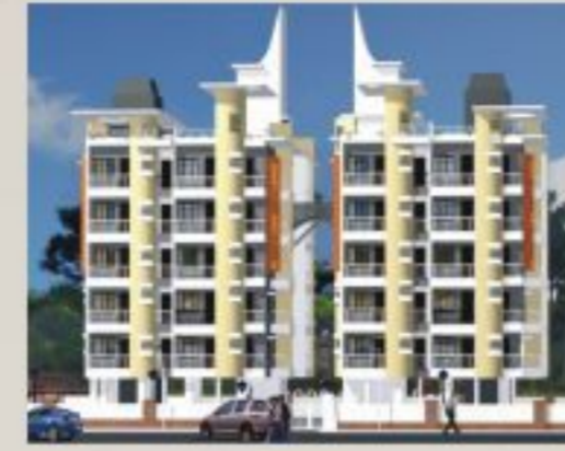
Agraja Bappanadu Residency, Mulky