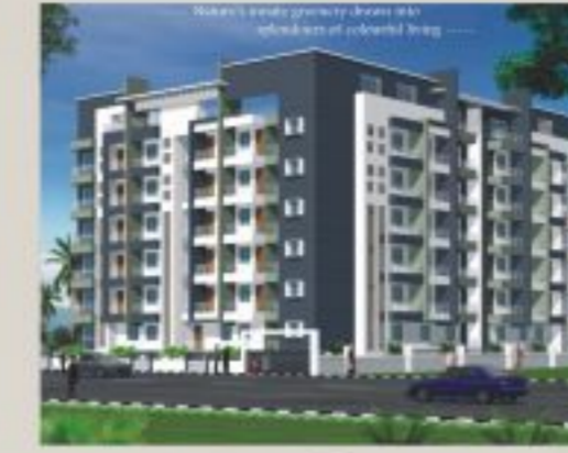
Agraja Sarovar Mulky