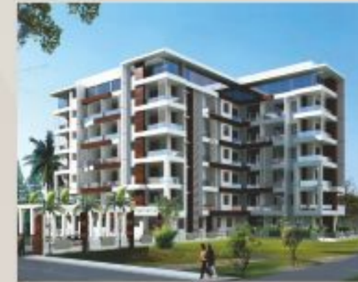
Agraja Vivanta Mangalore