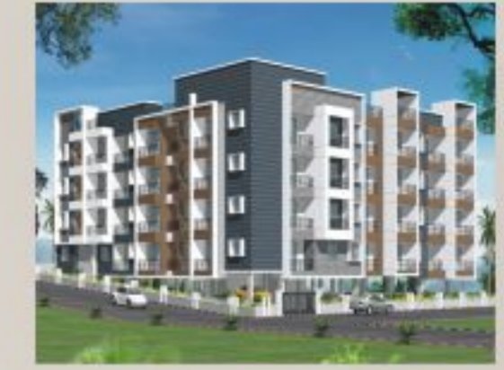
Agraja Garden Surathkal