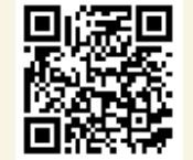
Scan for location