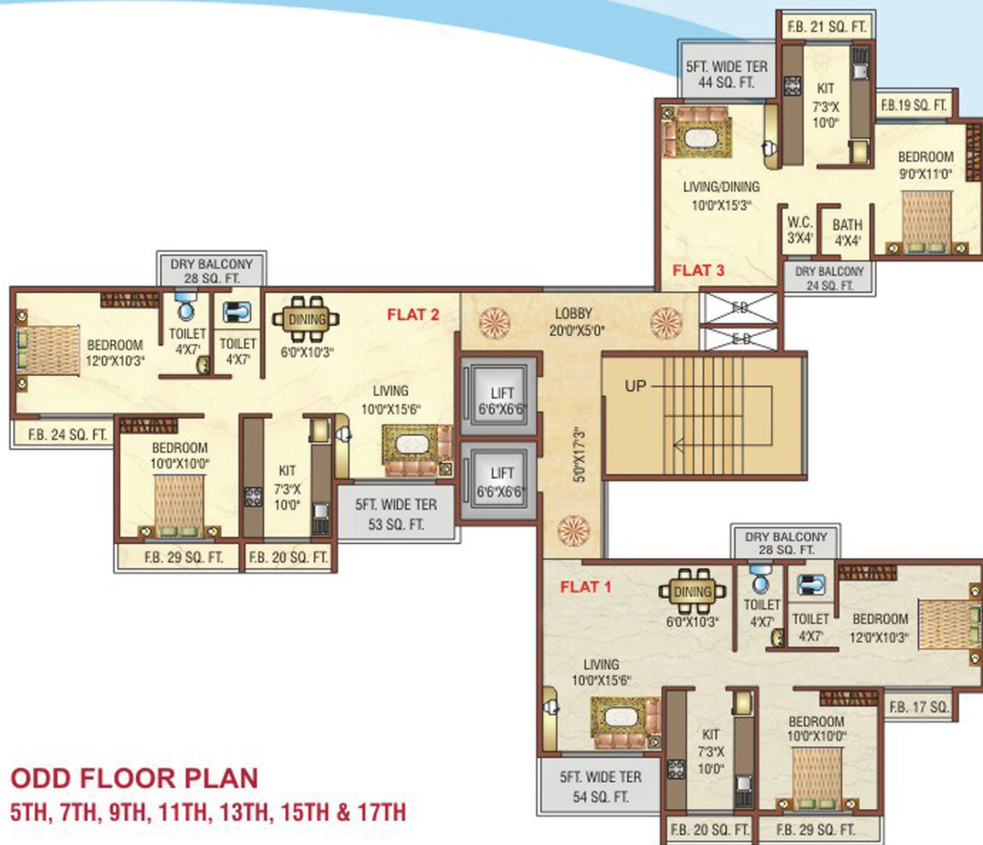
ODD FLOOR PLAN 5TH, 7TH, 9TH, 11TH, 13TH, 15TH & 17TH