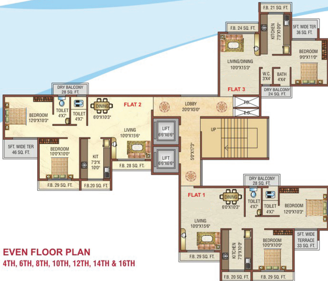
EVEN FLOOR PLAN 4TH, 6TH, 8TH, 10TH, 12TH, 14TH & 16TH