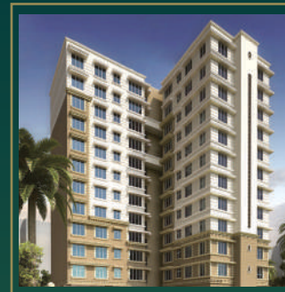
Skyline Viha (Vidyavihar-W)