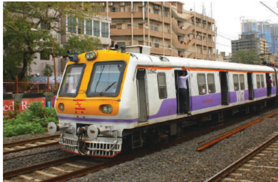
Best Railway Connectivity