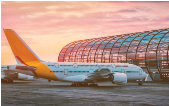
Navi Mumbai Airport

A home that simplifies travel is a true gem. Situated in the charming town of Karjat, Skyline Riverside is only a short distance from the Karjat Railway Station, upcoming karjat-panvel railway station and market. Notably, esteemed schools, international institutions, colleges, and educational centers are conveniently located within walking distance. Furthermore, quality healthcare facilities are just a stone's throw away. If you're looking for a delightful weekend getaway, the scenic destination of Matheran, Lonavala, Ganapati Mandir Karjat, Bhivpuri Waterfall, Kondana Caves Karjat are just a short drive away. In addition to these conveniences, Karjat boasts a delightful climate, thanks to its natural beauty that envelops approximately 90% of the area.