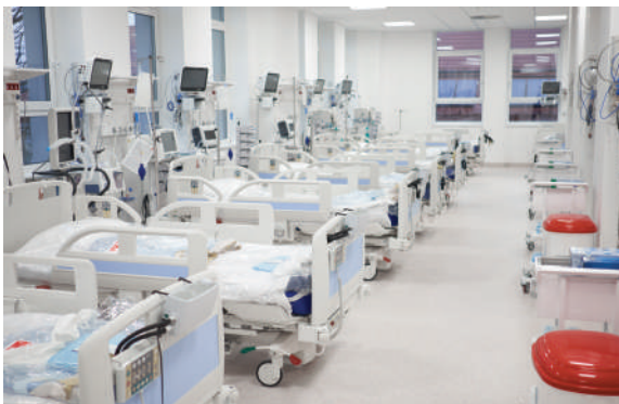
Health Care Facilities