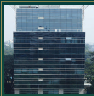
Skyline Epitome (Ghatkopar-W)