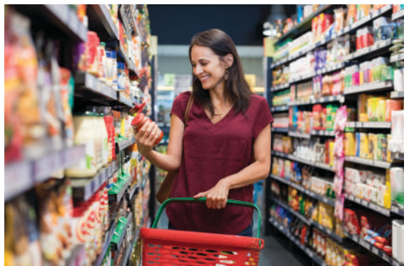
Market Place for Daily Needs