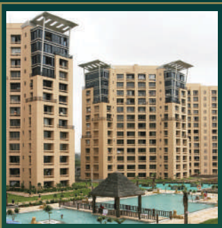
Skyline Oasis (Ghatkopar)