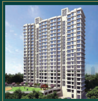
Skyline Sparkle (Nahur)