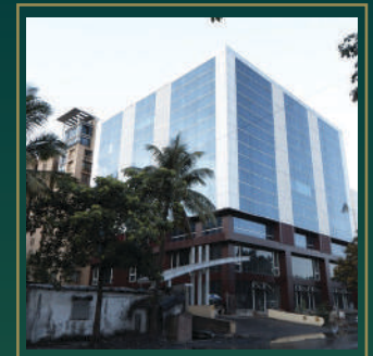
Skyline Wealthspace (Ghatkopar-W)