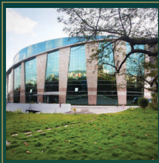
Skyline Icon (Andheri-Kurla)