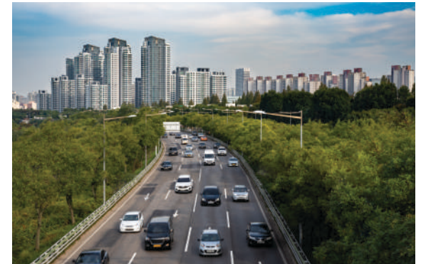
Excellent Road Connectivity