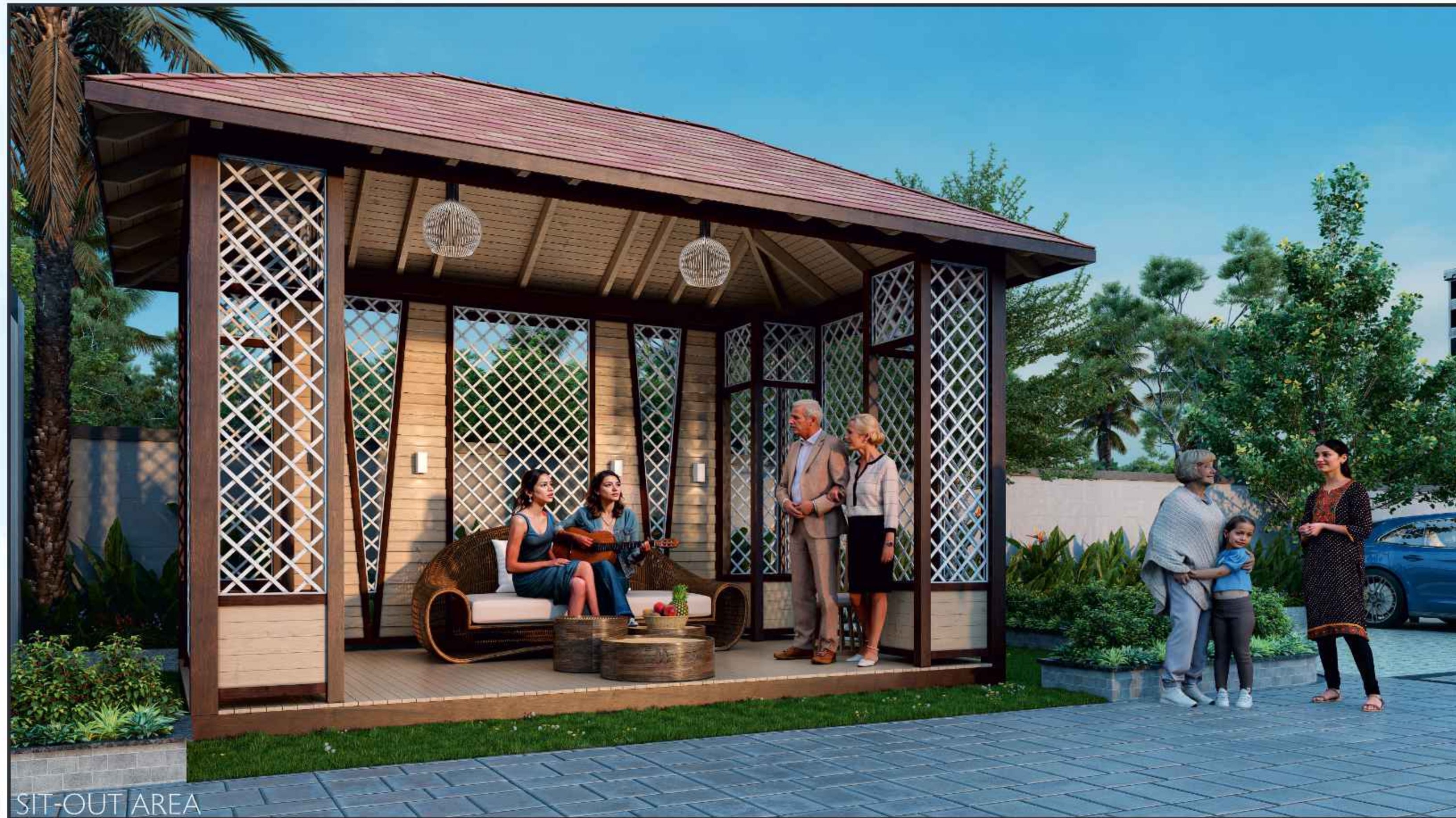
SENIOR CITIZEN SIT-OUT AREA

A peaceful corner crafted for quiet moments and warm conversation. Where mornings are refreshing and evening feels gentle and unhurried.