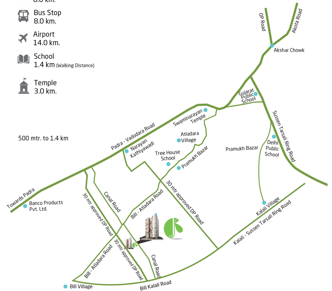
Map is representative only and may not be accurate