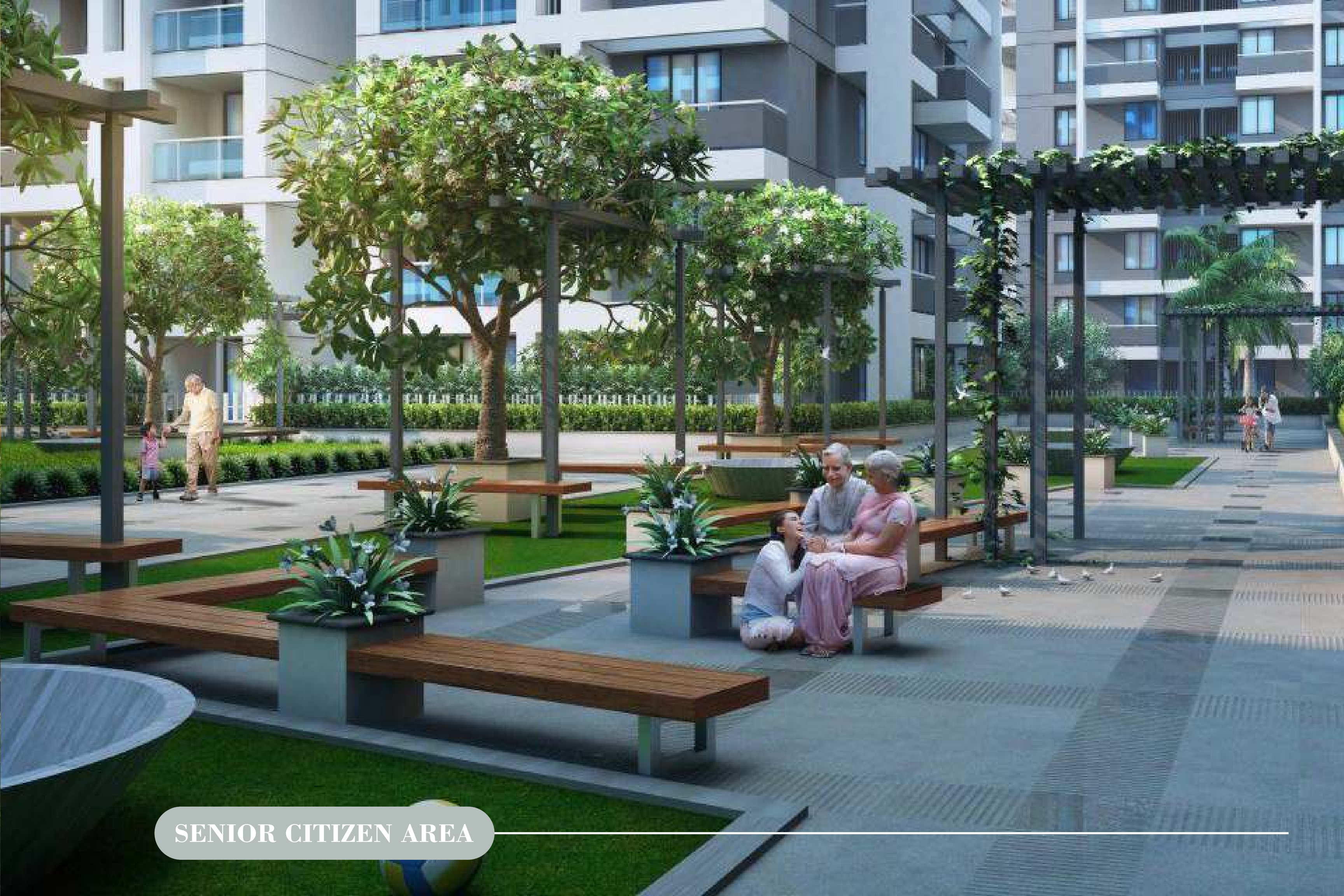
SENIOR CITIZEN AREA