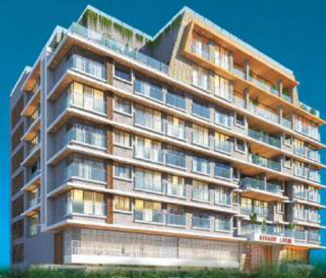
2022 Atharv Laxmi