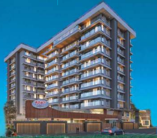
2021 Atharv Navasamaj