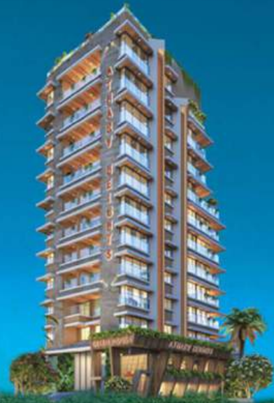
2021 Atharv Heights