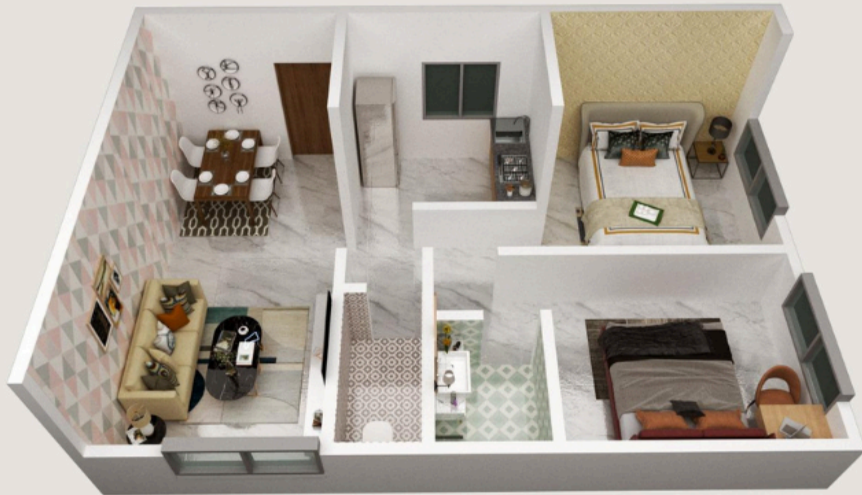
2 BHK - CONFIGURATION