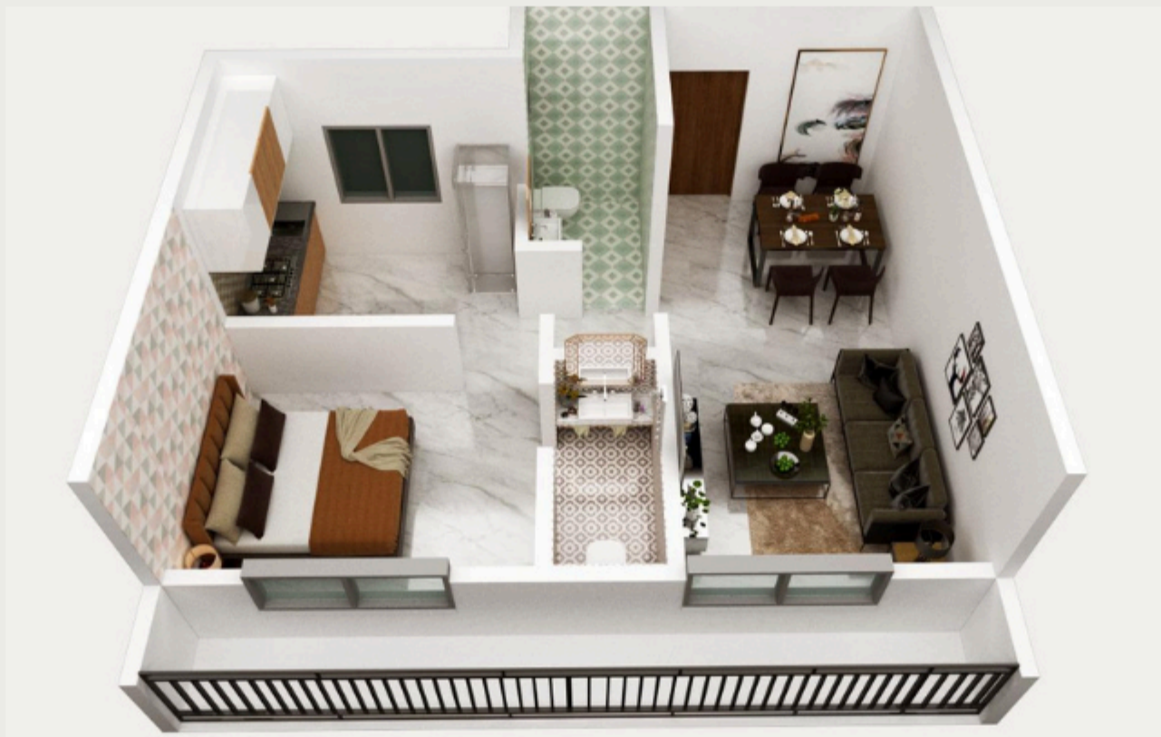
1 BHK - CONFIGURATION