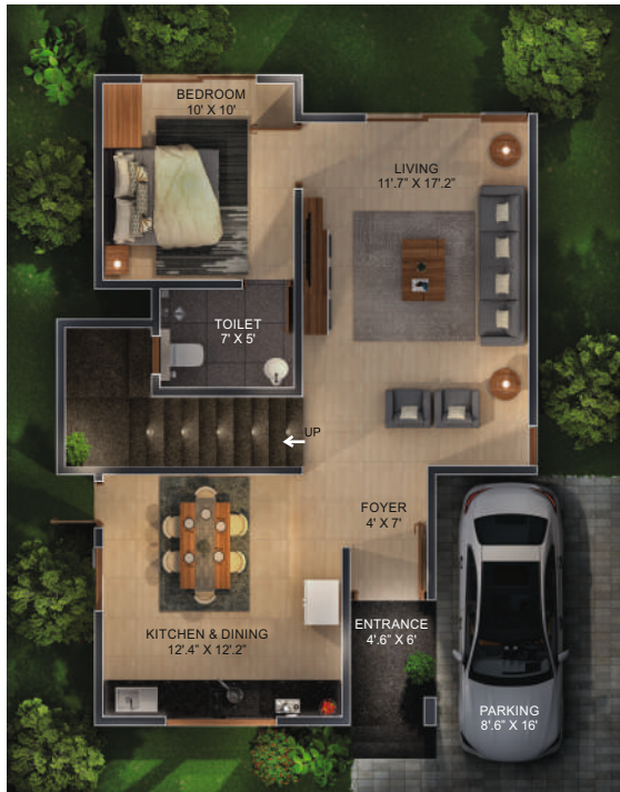
Ground Floor - SBA 880 sft