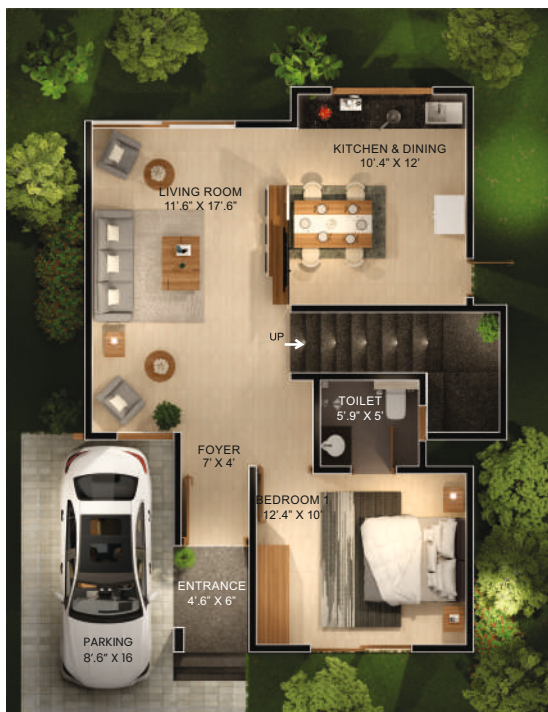
Ground Floor - SBA 880 sft