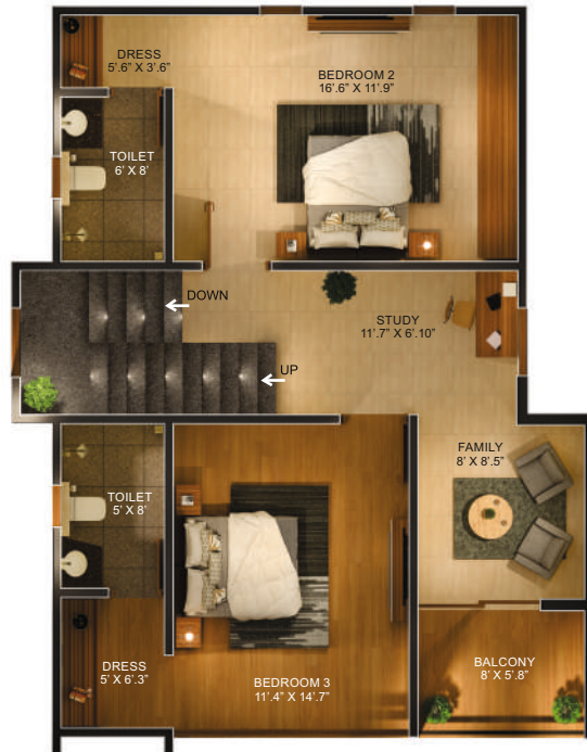
First Floor - SBA 880 sft