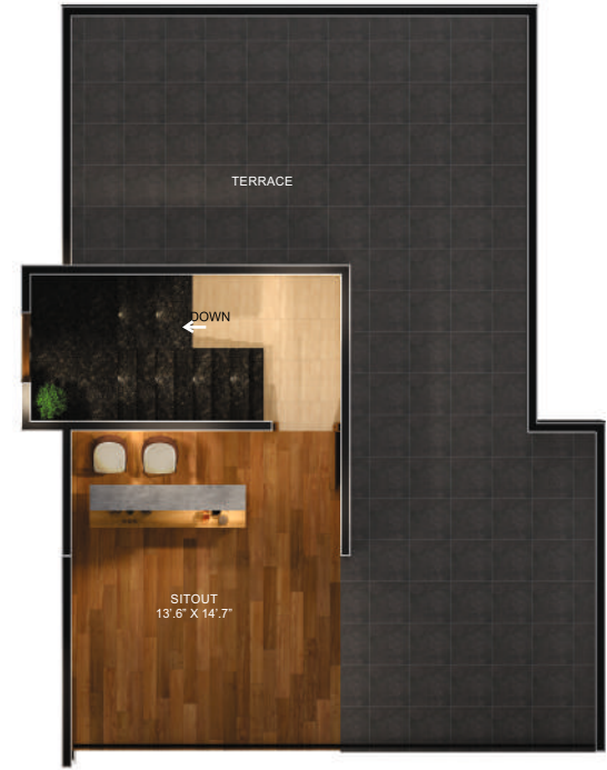
Terrace - SBA 125 sft Mono Pitch - SBA 215 sft