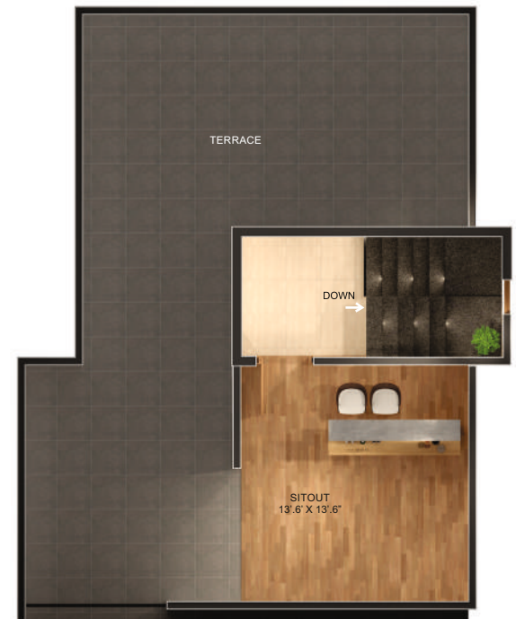
Terrace - SBA 125 sft Mono Pitch - SBA 215 sft