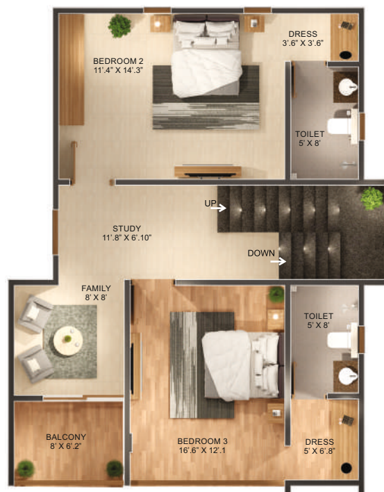
First Floor - SBA 880 sft