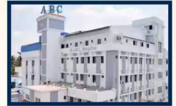
Near by Hospital