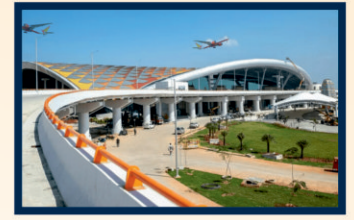
International Airport-25 min