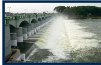
Grand Anaikat Kallani-30 min