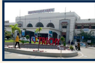
Railway Junction-15 min