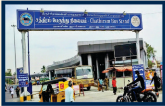
Chatram Bus Stand-5 min