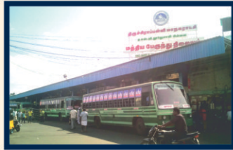
Central Busstand-10 min