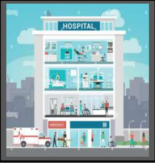
5 mins From RN Tagore Hospital Mukundapur