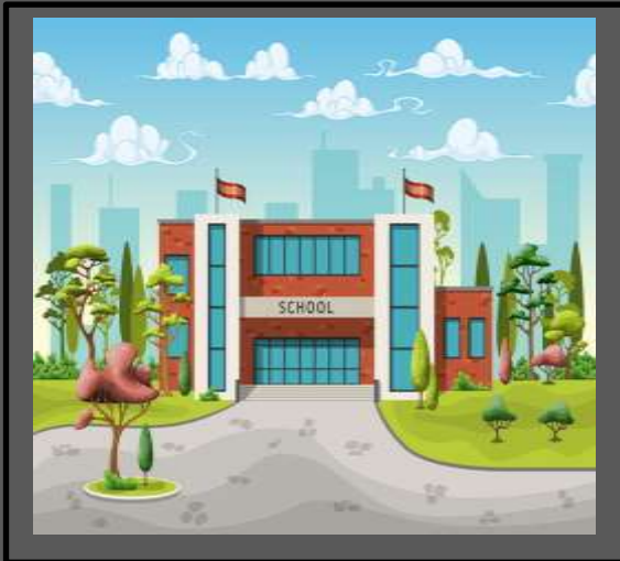
5 mins From New Garia Metro Station