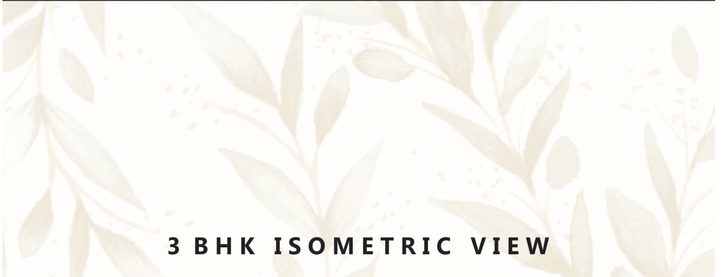
3 BHK ISOMETRIC VIEW