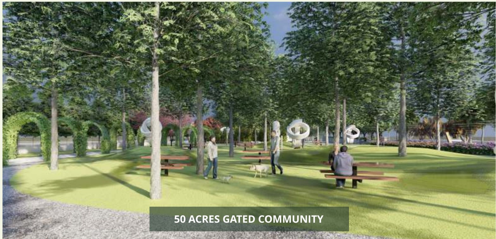
50 ACRES GATED COMMUNITY