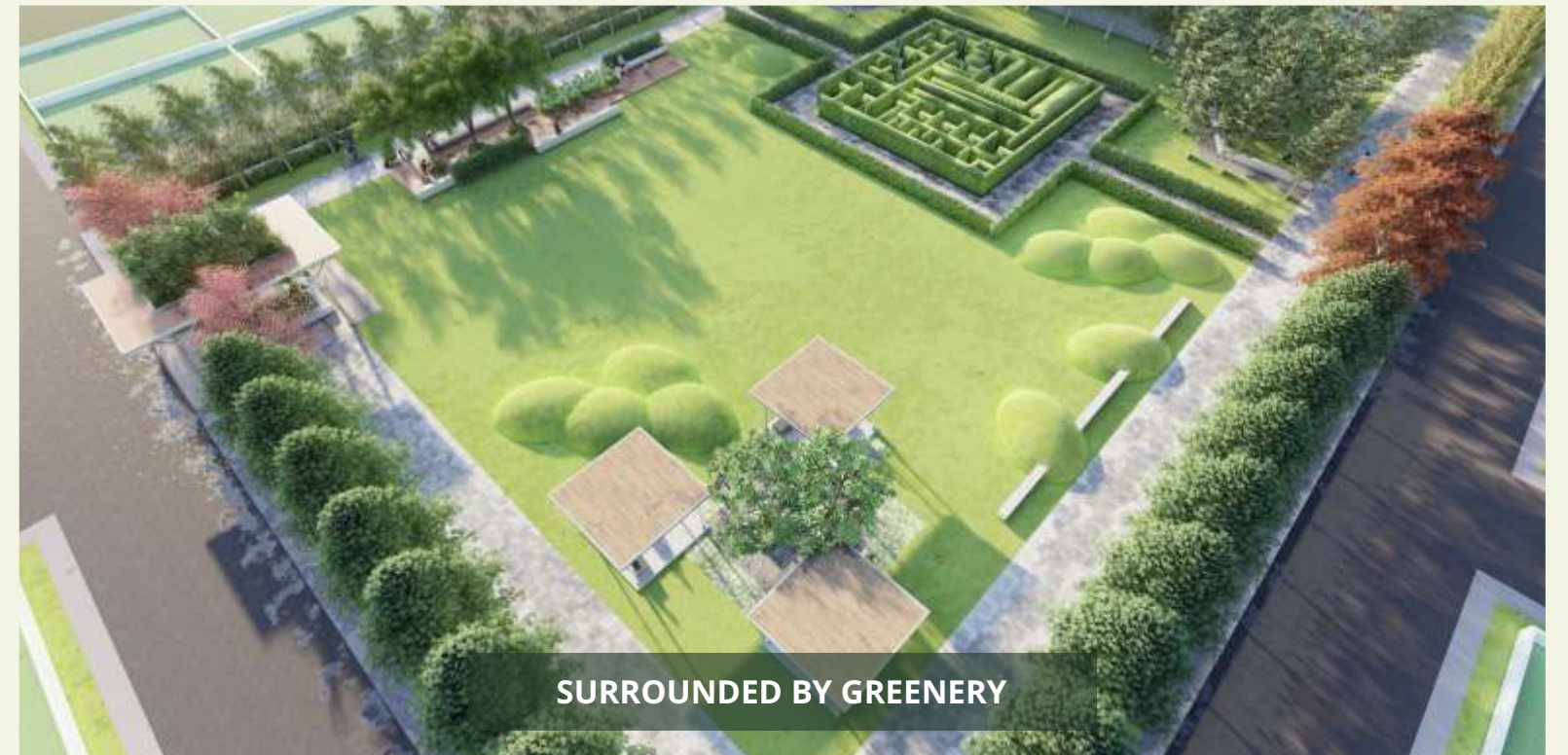
SURROUNDED BY GREENERY